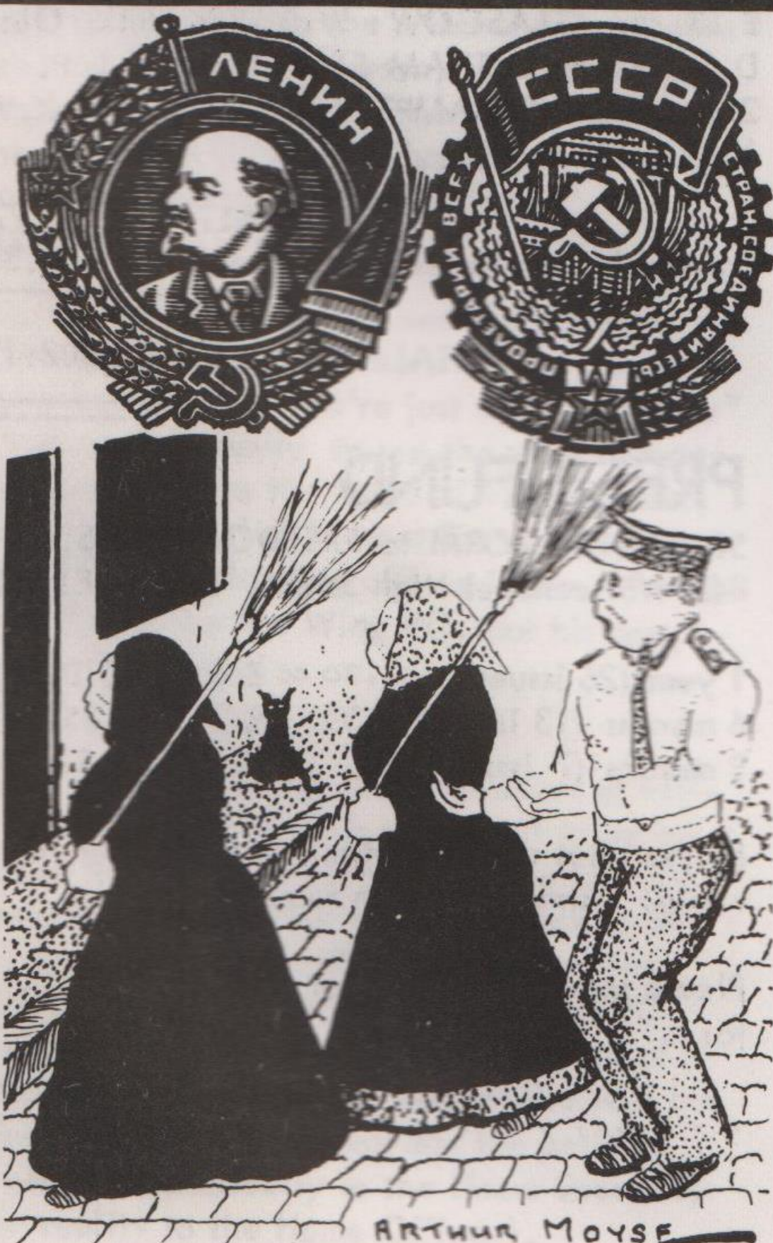
DRAWN FROM LIFE

Policeman hurrying elderly women street cleaners to sweep the road before the arrival of a Rumanian delegation. Russia. August 1976.