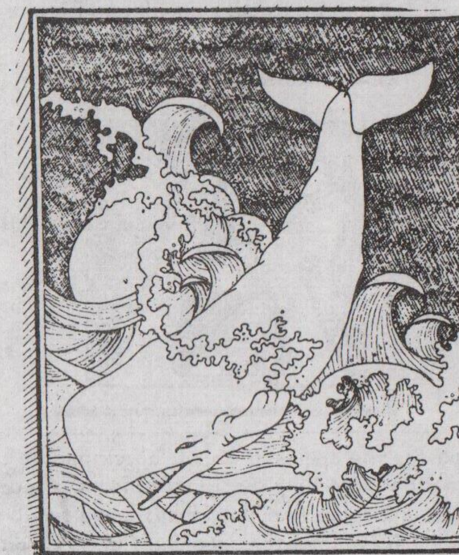
Sperm whale or cachelot (almost extinct)

Given this situation the only way to save the cetaceans - one of the greatest and most magnificent and most mysterious races to inhabit the earth, and to inhabit it for over 3.0 million years - is to do the following:-