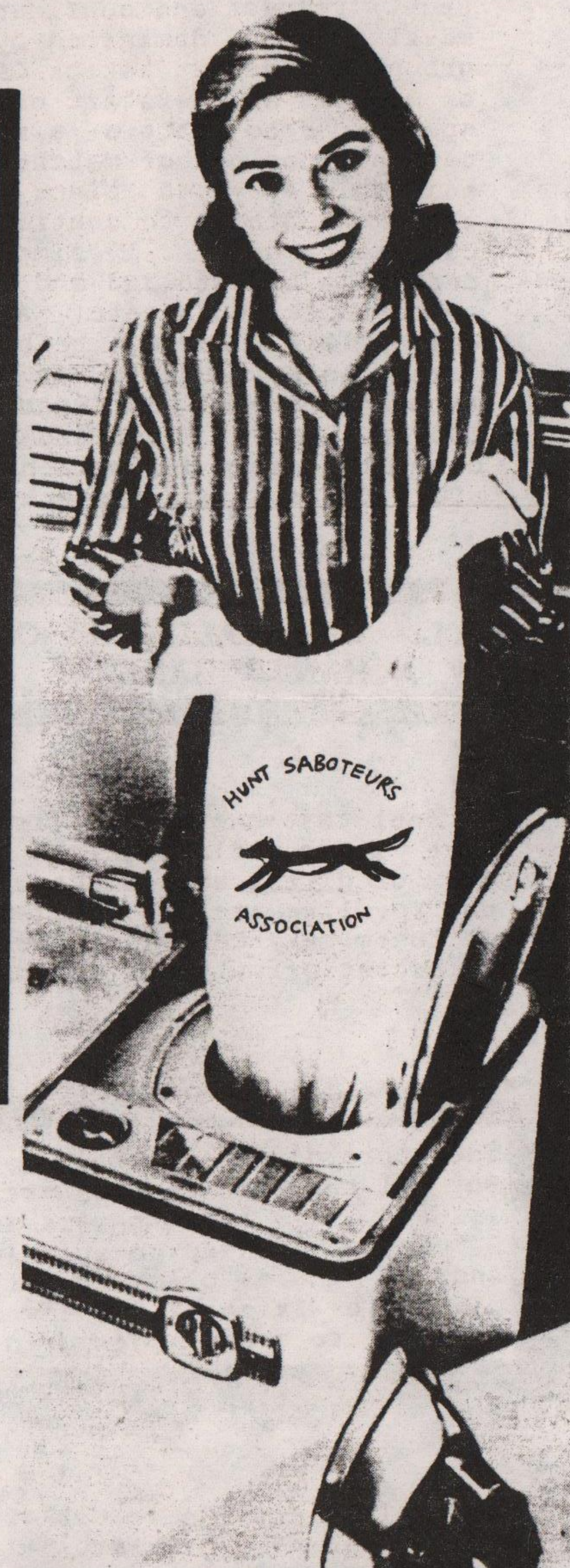
Working like a dog to keep men happy...

This leaflet is aimed at men in the belief that we, as men, have got to start taking responsibility for the way we live, and the way we oppress women. This doesn't mean that we think women are "passive" or incapable of changing their lives. Women have always refused to be mere "victims". And this leaflet has been inspired in lots of ways by their struggles and their strength in fighting back.