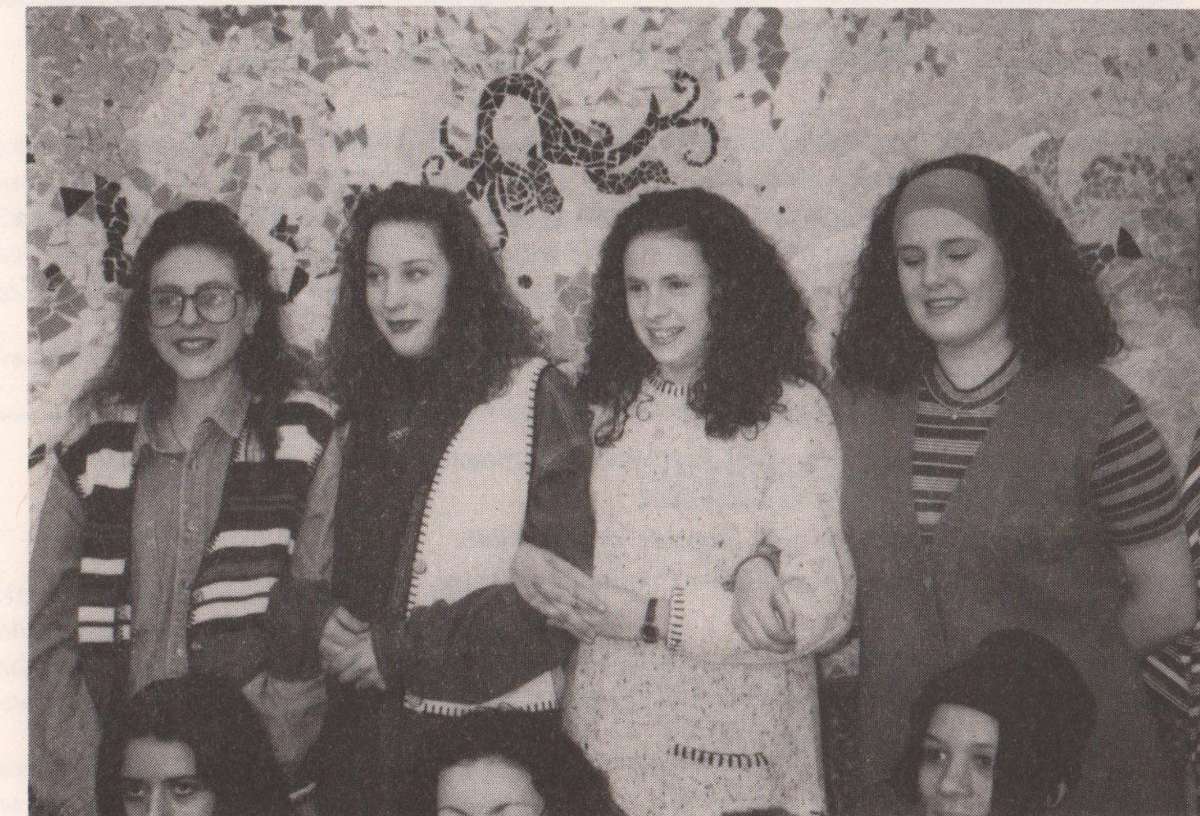
Young people from the Russell Youth Centre (St Ann's) with the Marine Life mural they have created with a community artist. The mural will form part of a new garden and activity area at the centre, being built with the support of Groundwork Greater Nottingham.