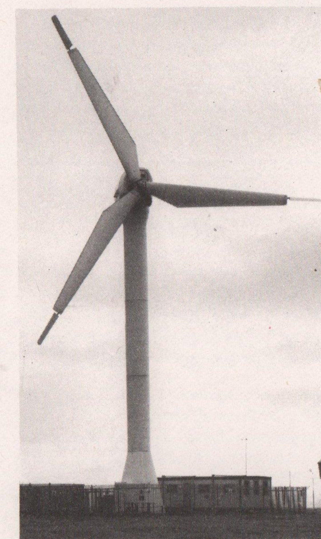
Wind Turbine at Sexbierum Wind Farm in Holland.