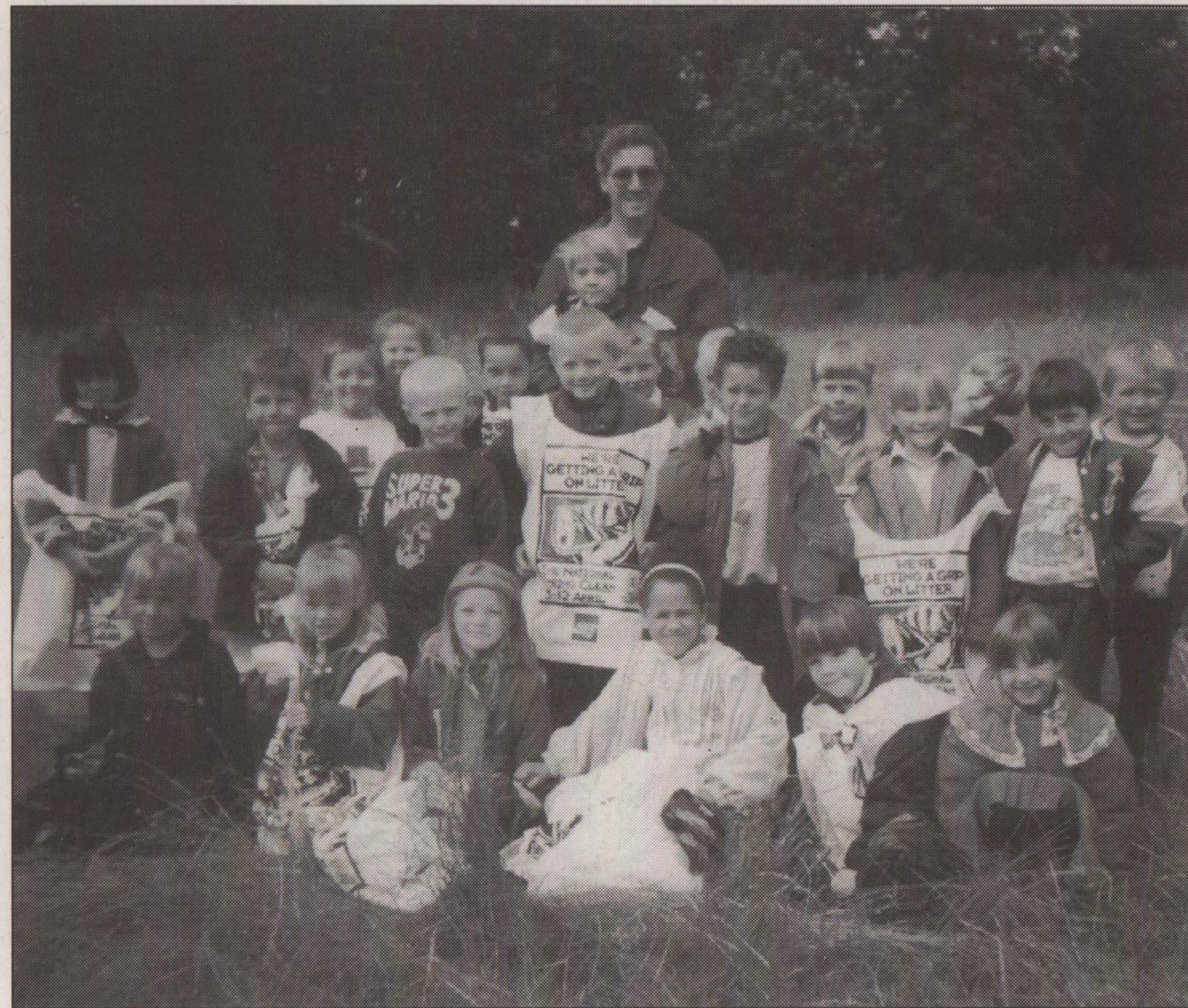
Pupils from Springfield Junior doing a litter-pick in Bulwell Hall Park in April.

Our members do not just include WI members - we have quite a few men who work in a variety of occupations, and also some who are retired. If anyone is interested in the group they will be made very welcome.