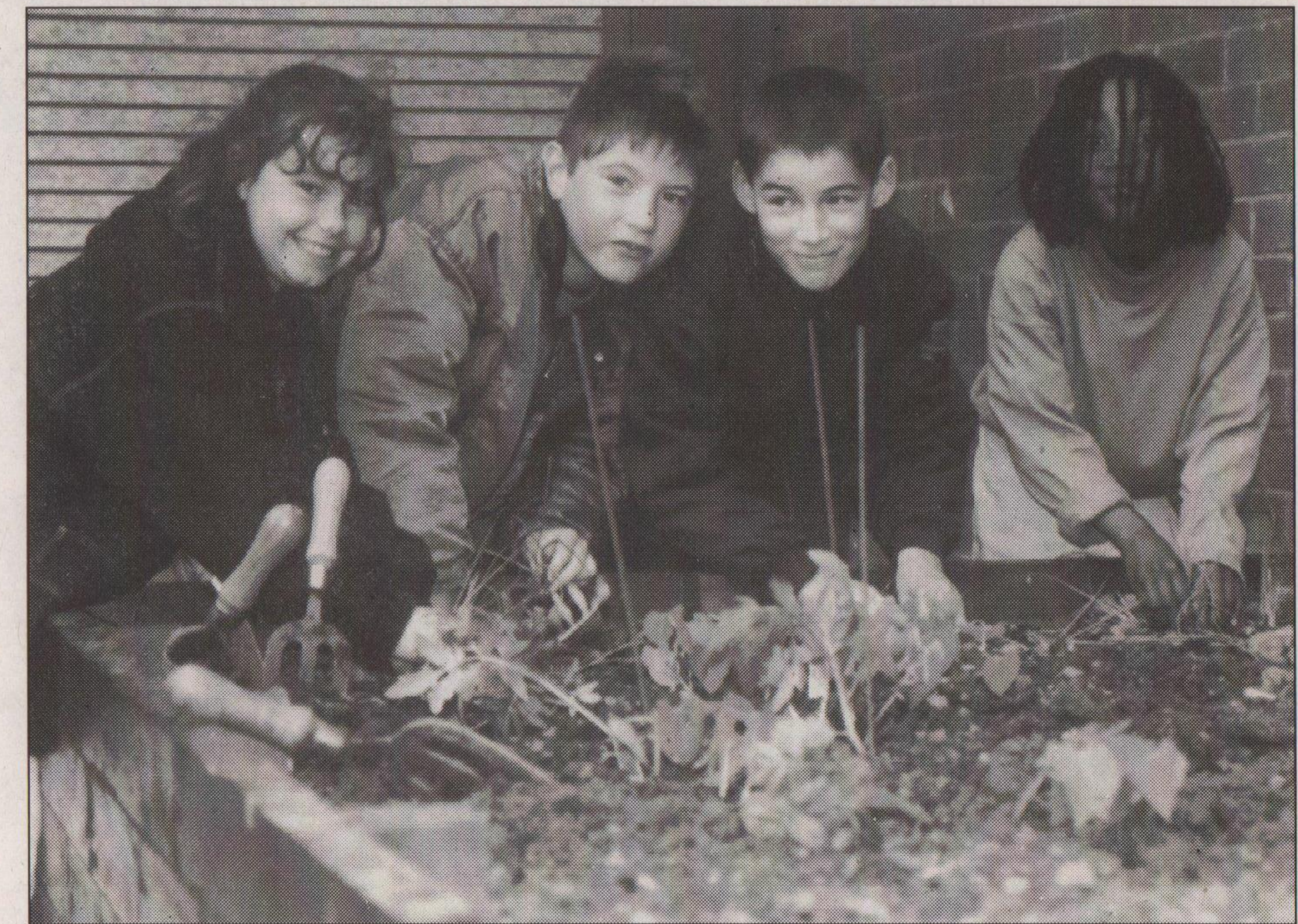
Children planting up the Metrazone garden (see Groundwork article).

The Metrazone now has play facilities in place, with raised beds for gardening and safety surfacing for all year round play.