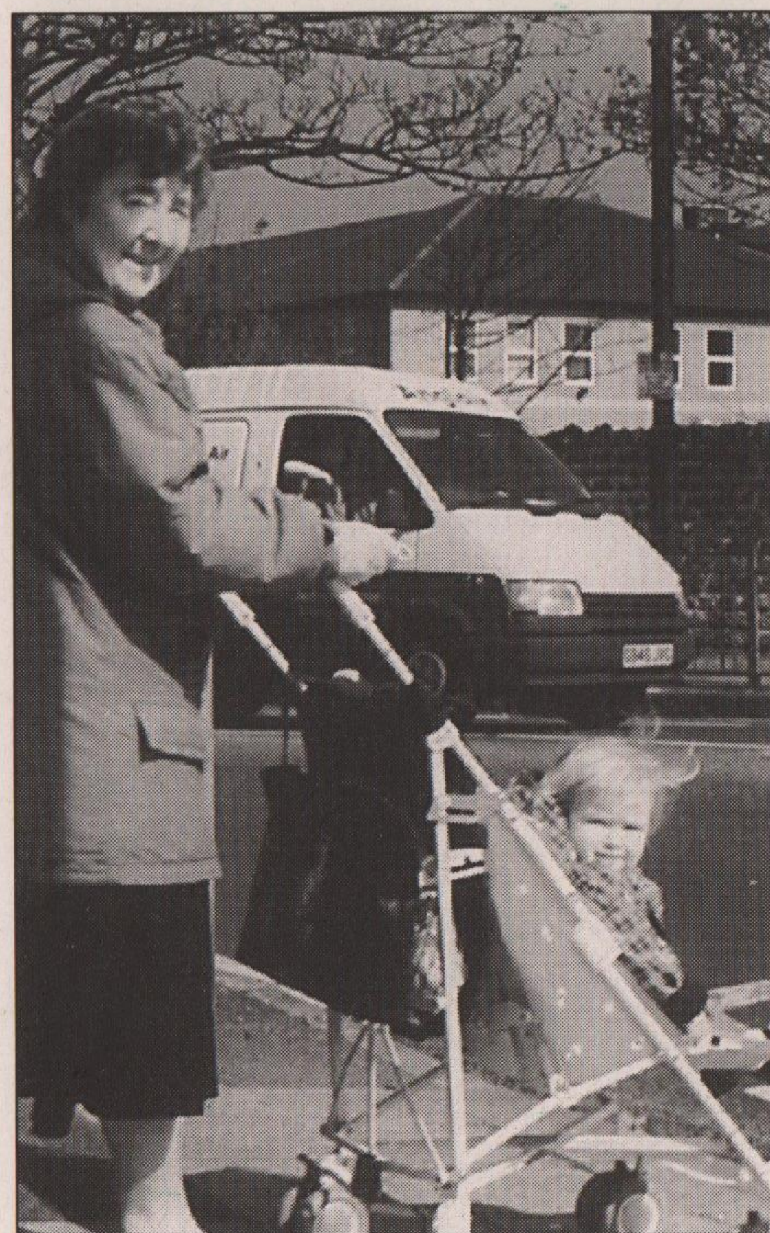
The impact of traffic fumes on women & children is being highlighted by WEN in their current campaign.

Every day children, who are down at car exhaust level much of the time, and women, who make up the majority of pedestrians, breathe in a polluting cocktail of toxic gases.