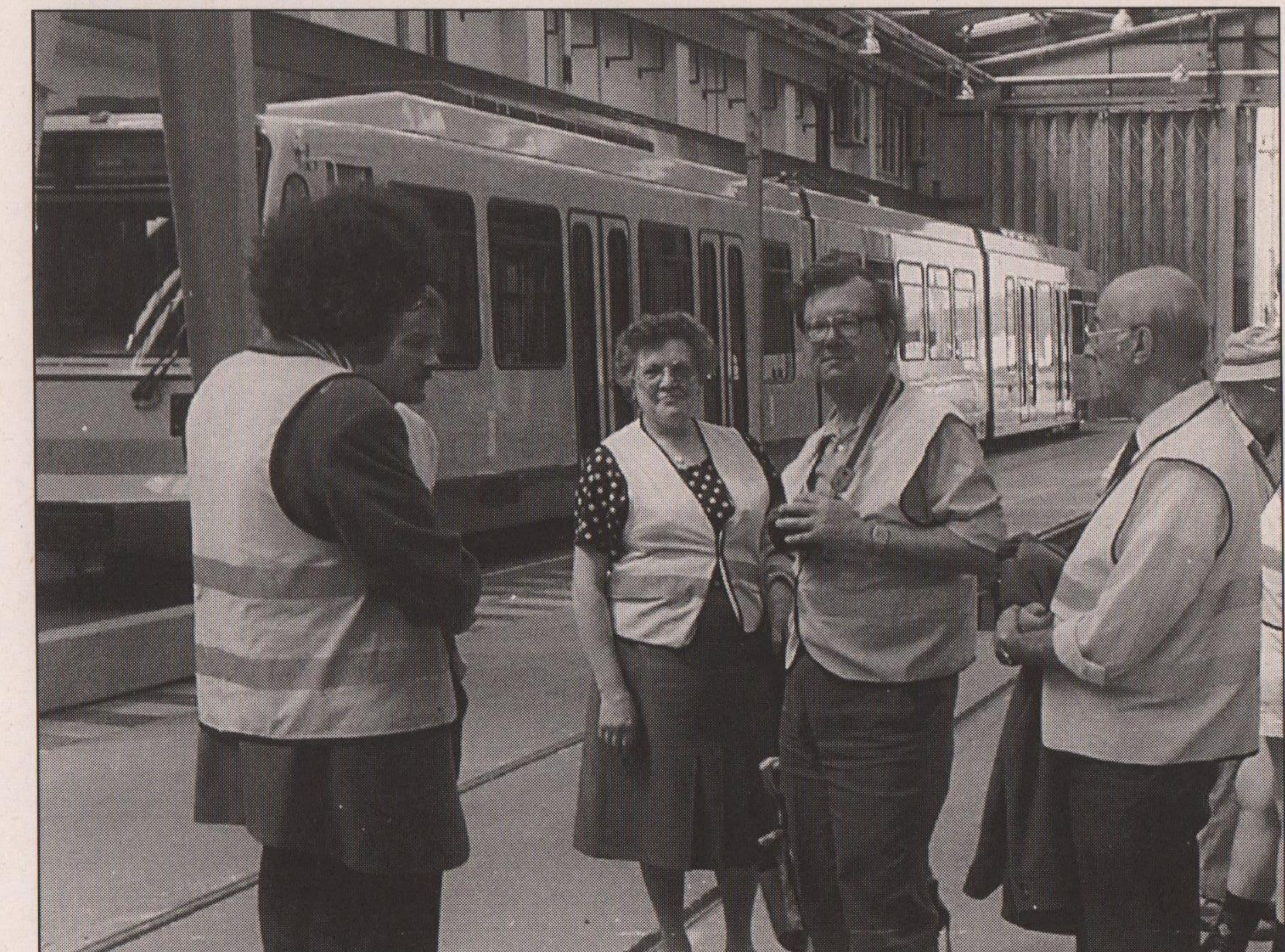
NT2000 members on a visit last year to the Ivanhoe line in Leicestershire, after their AGM.

An important part of our campaigning is good media coverage. NT2000 gives regular TV and radio interviews in response to various transport plans and announcements, as well as continuing to write letters to newspapers on diverse transport issues.