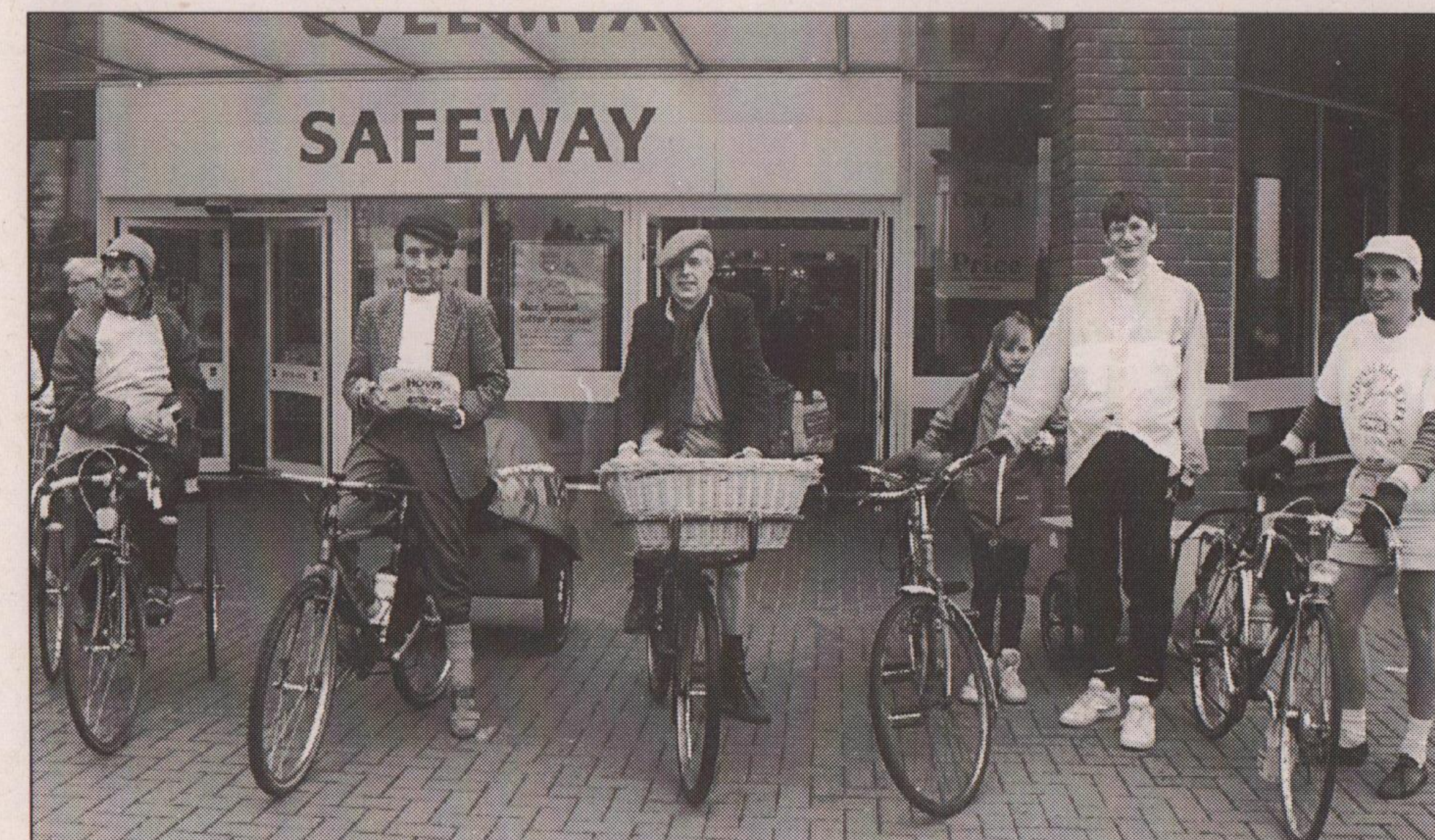
One of the Guided Cycle Rides in Nottingham during Hovis National Bike Week in June. The ride aimed to highlight the lack of secure cycle parking at several local supermarkets.

For more information about Pedals contact Hugh McClintock on 981 6206.