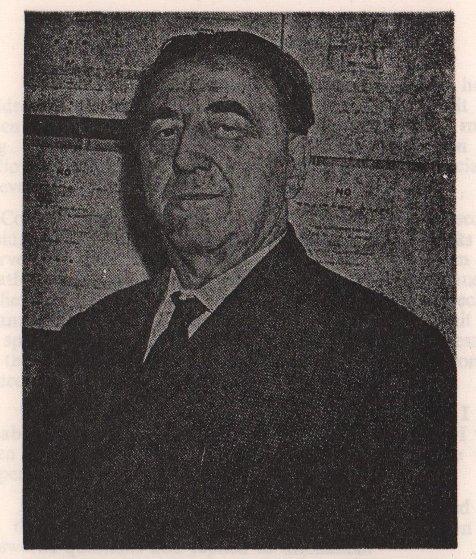
GUY ALDRED (November 1962)

We do change the world. One generation merges into another. The hopes of yesterday's heroes and martyrs become the inspiring slogans of the martyrs and heroes of today, and by them are passed on to the heroes and martyrs that will be tomorrow. An unchanging yet changeless logic of development.