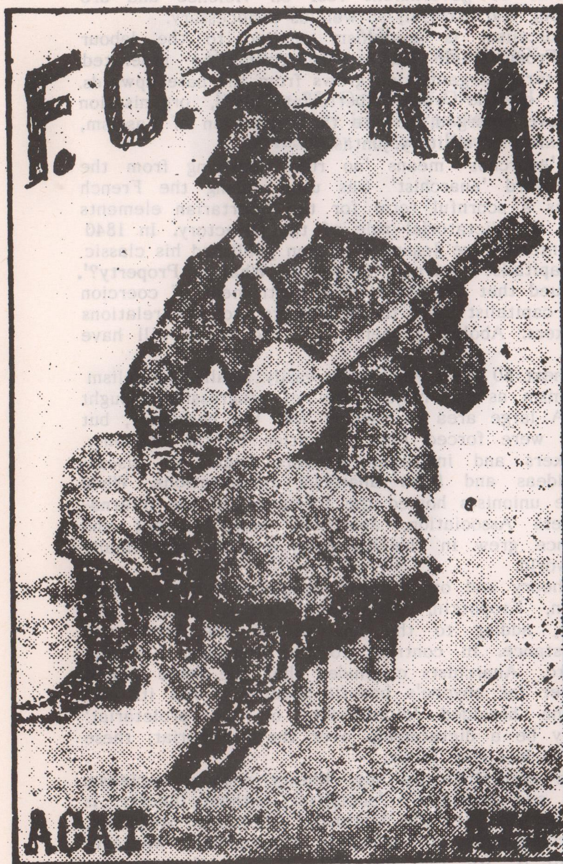
1920's FORA poster