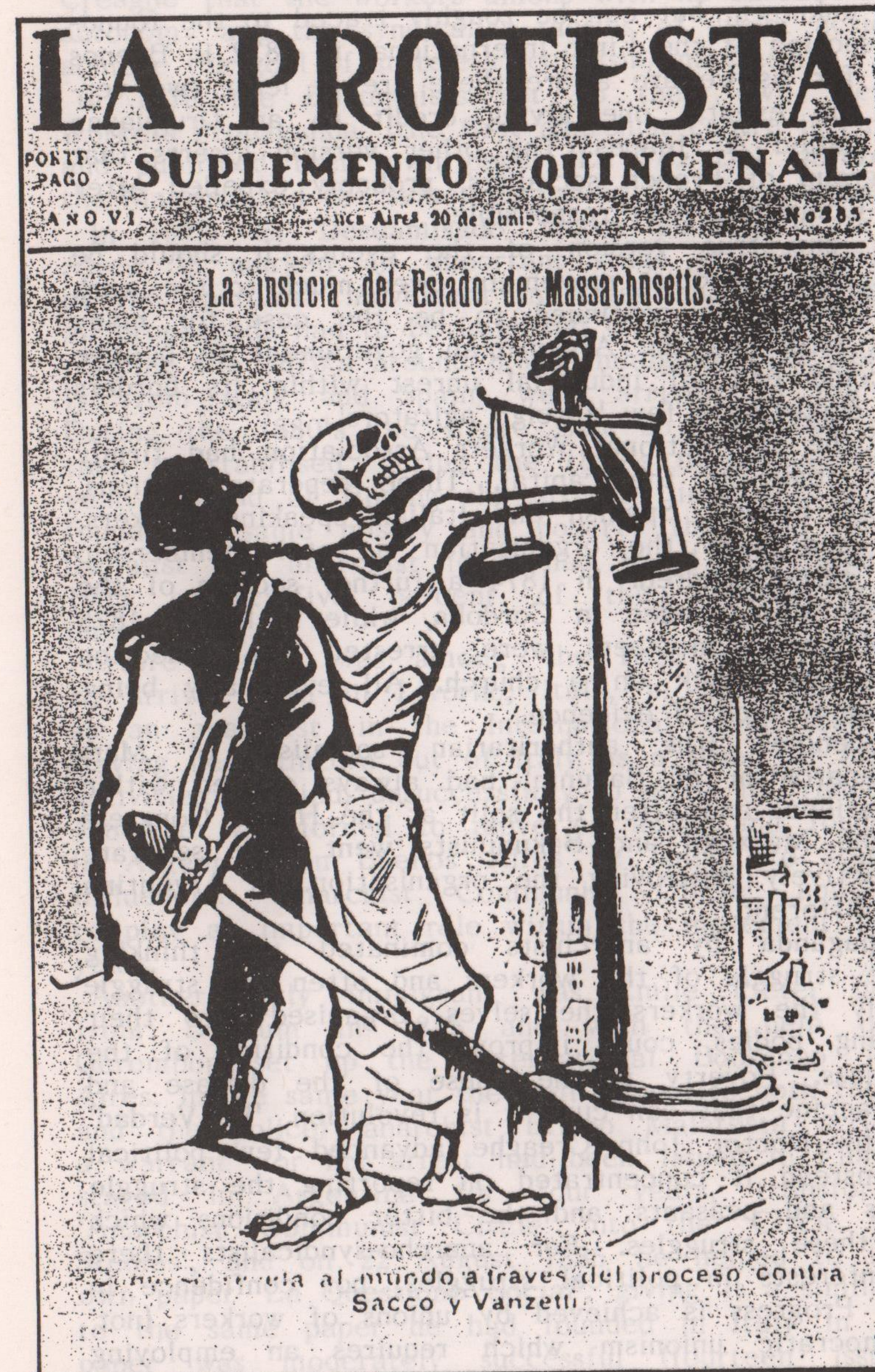
May Day supplement to 'La Protesta'.