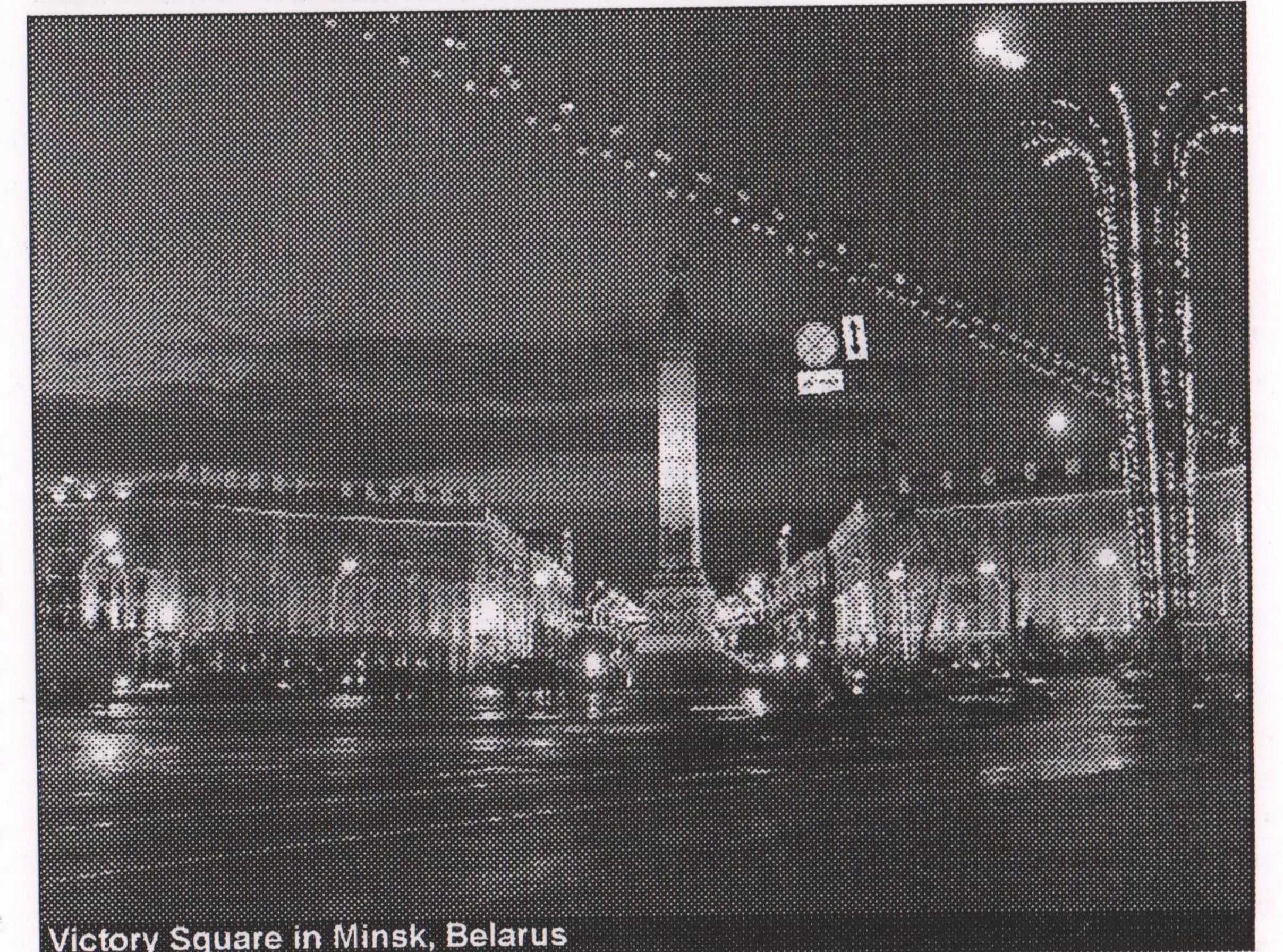
Victory Square in Minsk, Belarus

Pauluk: I read about anarchism in the library; there were books by people like Kropotkin. But not much was available. We didn't have contact with other anarchists either in the west or in other eastern European countries. There wasn't even much communication with other anarchists in Belarus.