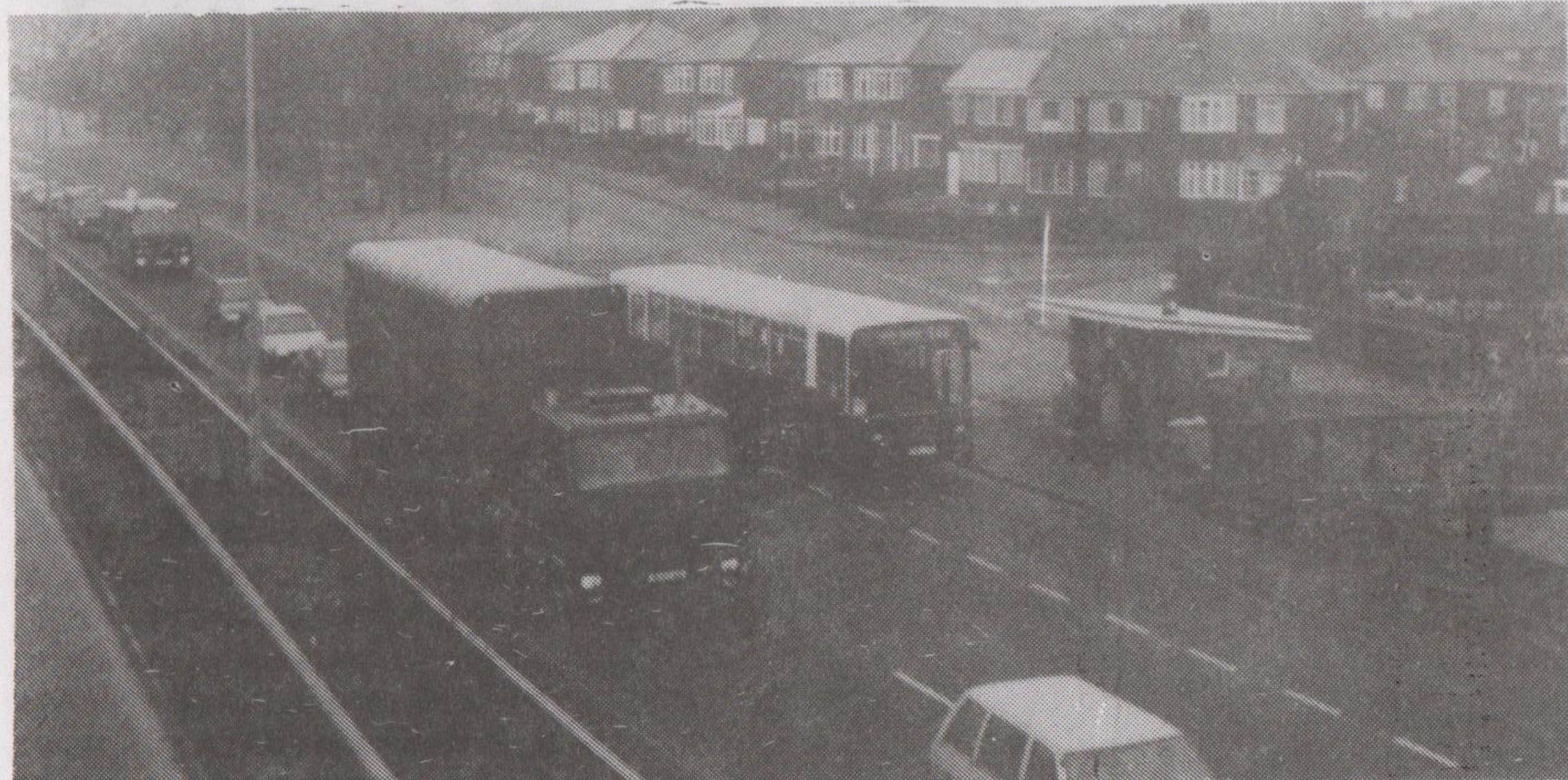
A lorry carrying nuclear warheads stuck in a traffic jam in Newcastle.

The CIA has expressed "some concerns over the accuracy of South Africa's