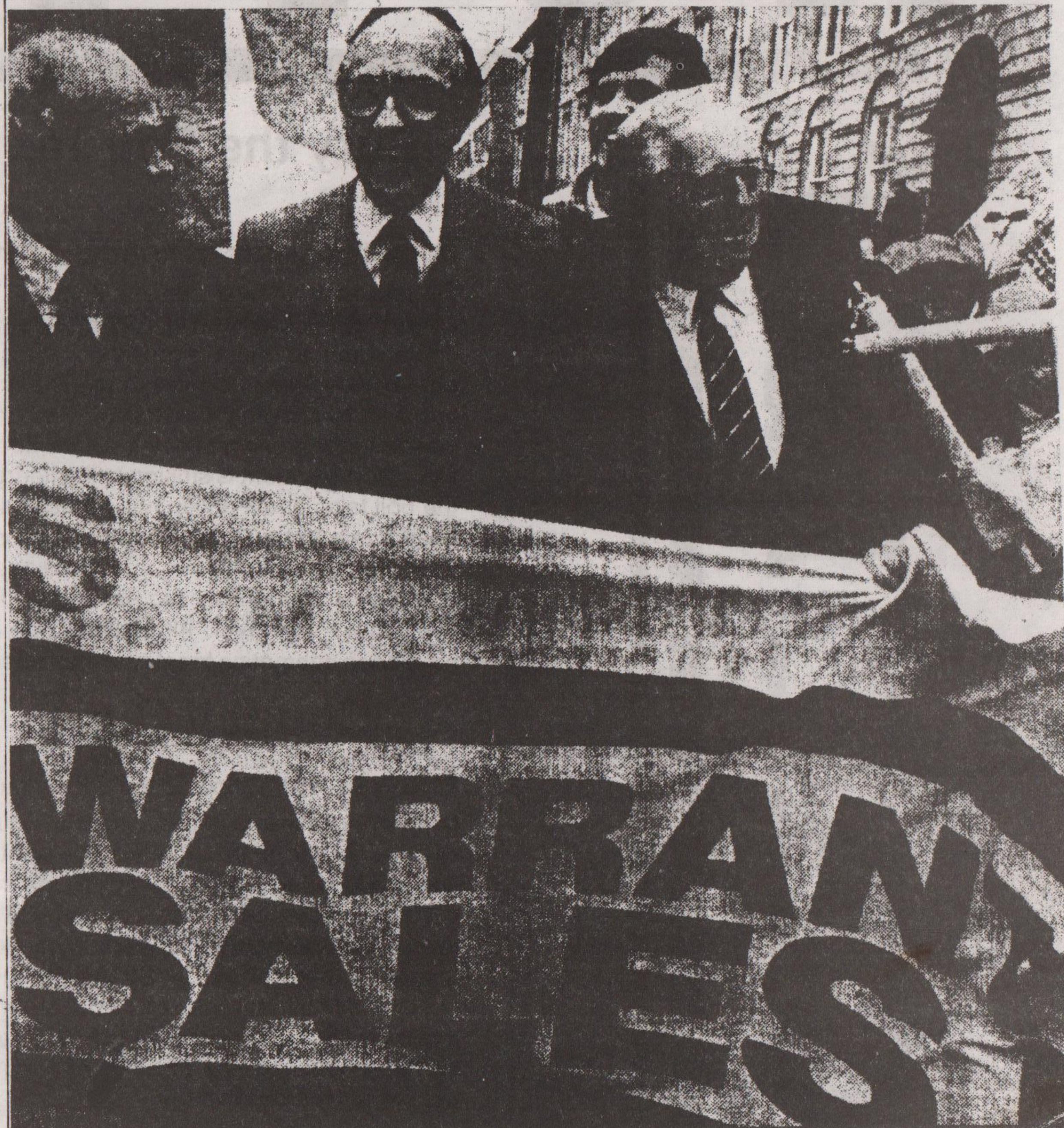
Labour's Answer to the Poll Tax

The poll tax is only one attack on our living standards and rights, only one battle in the class war. This struggle will only stop when the working class organise as a class and take over and run our communities and workplaces for our needs and desires and the well being of the planet, and not for profit.