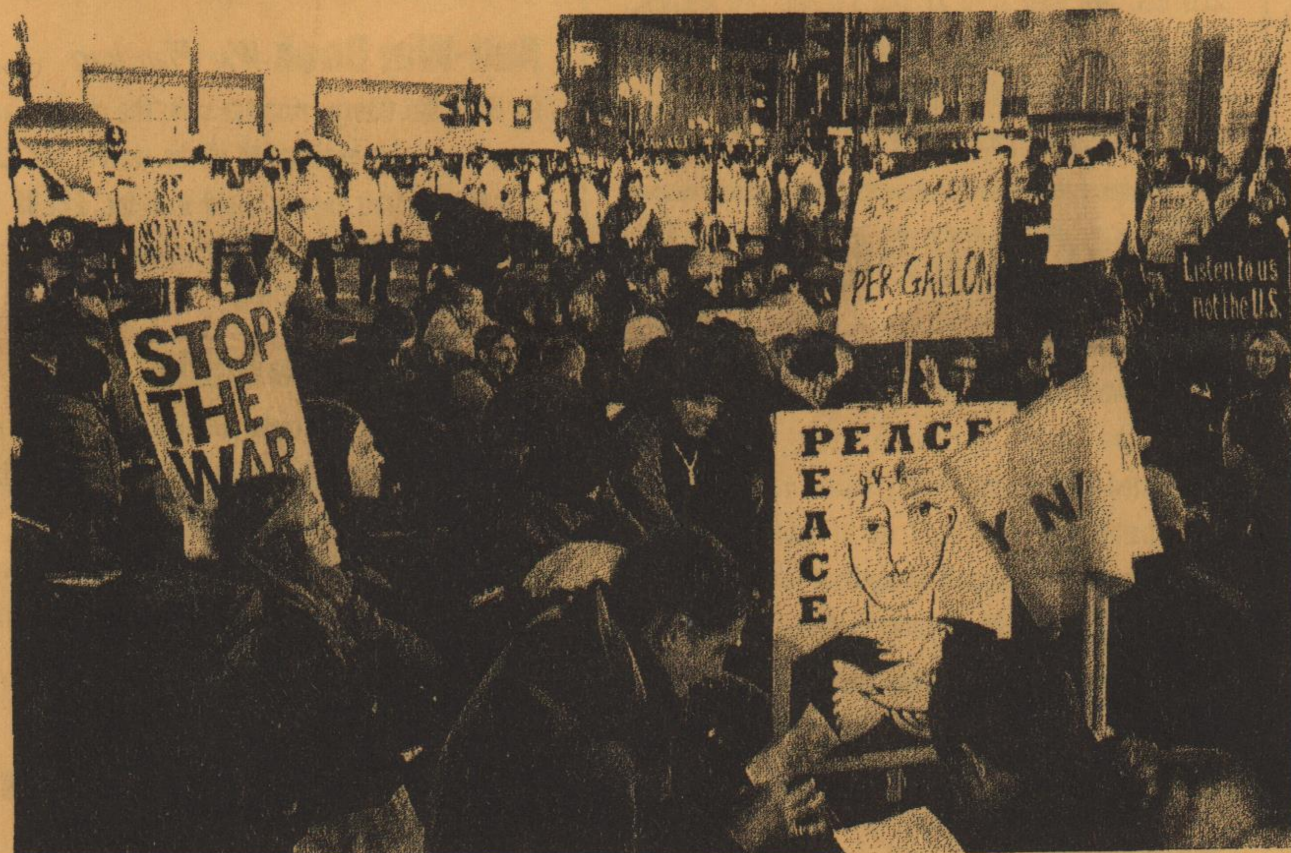
Sitting-down after the March, 15 February 2003

The people of Iraq are living in fear. Mothers, fathers, sons and daughters are looking at each other and wondering who will survive, and how they could possibly cope with the loss. Oxfam has stated that a military assault on Iraq could 'devastate the lives of millions of people and trigger a humanitarian catastrophe.'