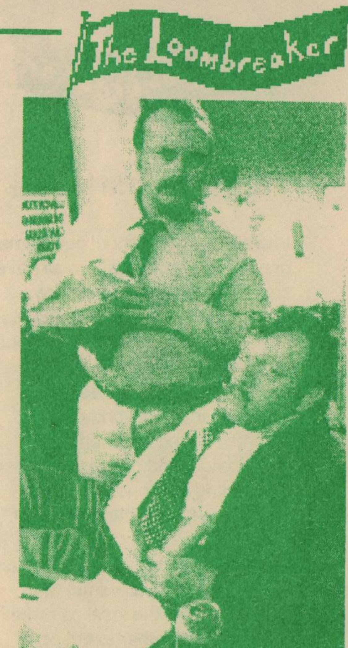
Special Branch hard at work 01/04/00

Elsewhere opposition to the Terrorism Bill is gathering momentum. In Morpeth,