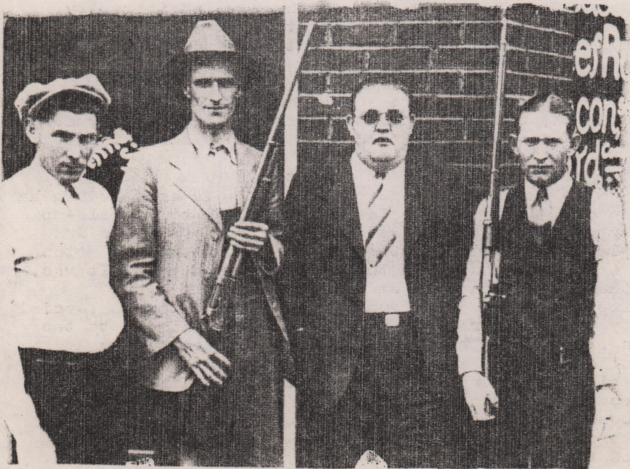
"BOYS AND GIRLS I'D LIKE YOU TO MEET YOUR NEW VICE-CHANCELLOR"

ANYONE INTERESTED IN HELPING TO START A CLAIMANTS UNION IN HULL PLEASE CONTACT LSS