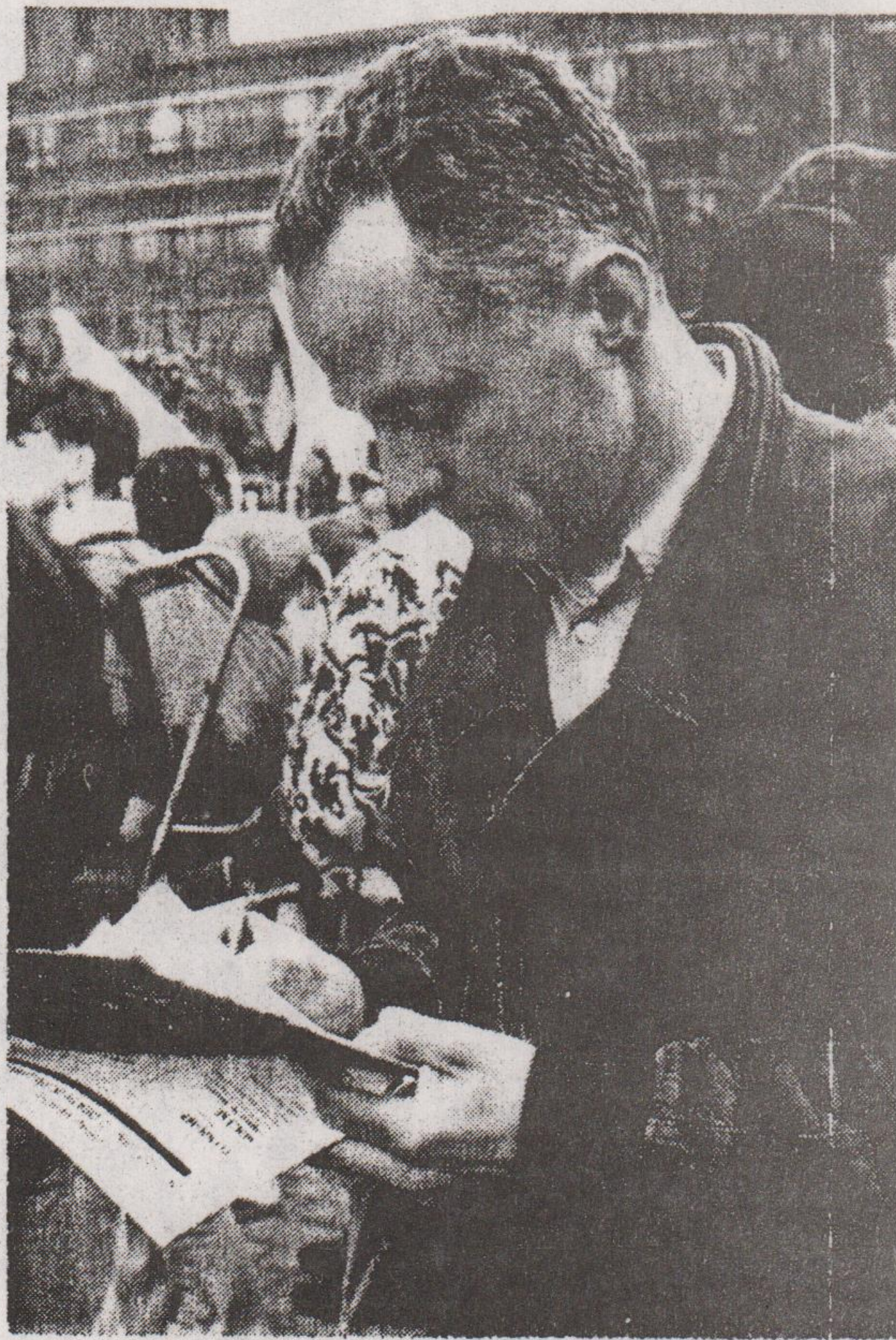
"Colin" signing a VMDC petition.

The campaign this week attended a conference in London, called by the Tamil Action Committee. At the conference Amnesty International renewed its support for Viraj. This was done against the background