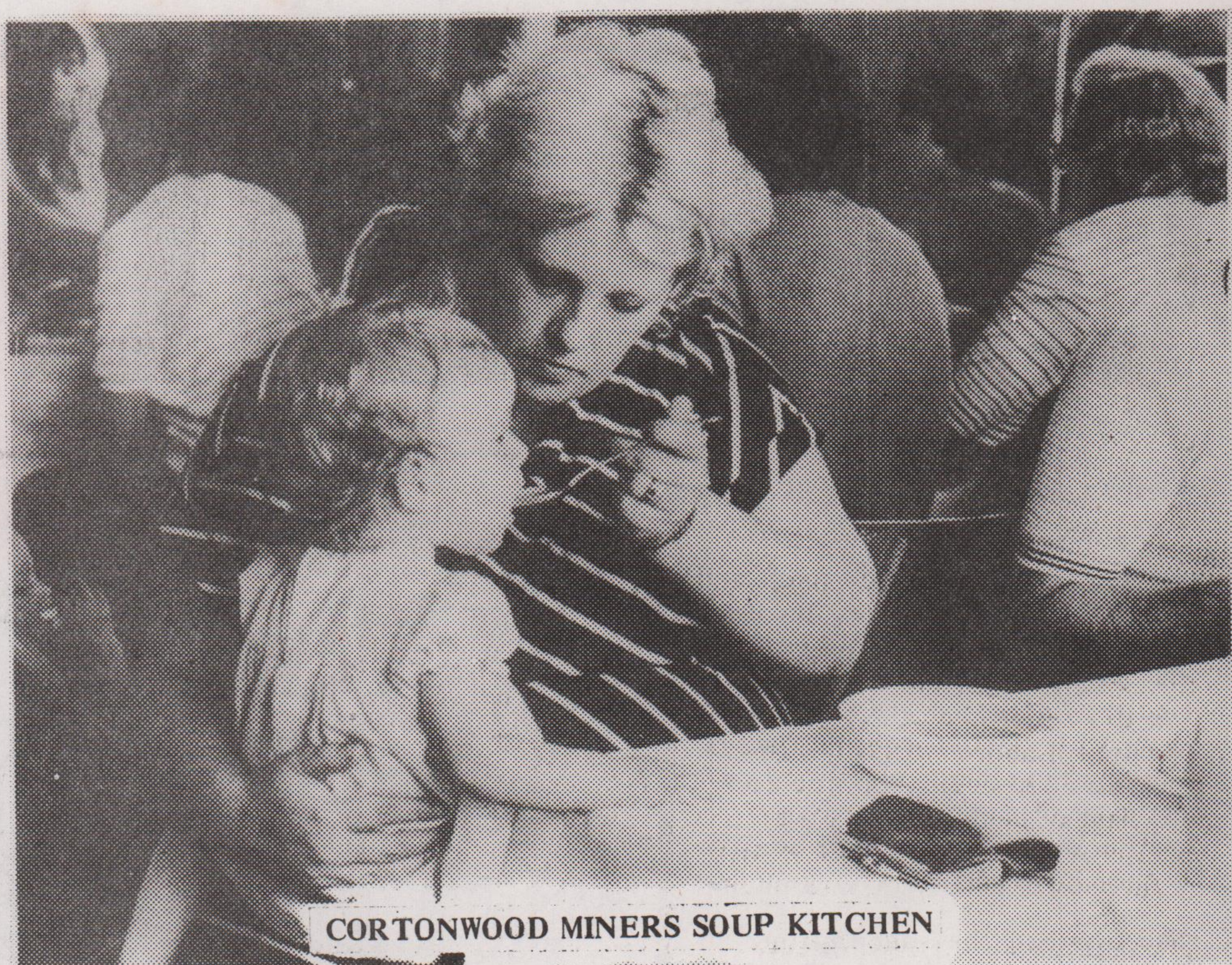
CORTONWOOD MINERS SOUP KITCHEN