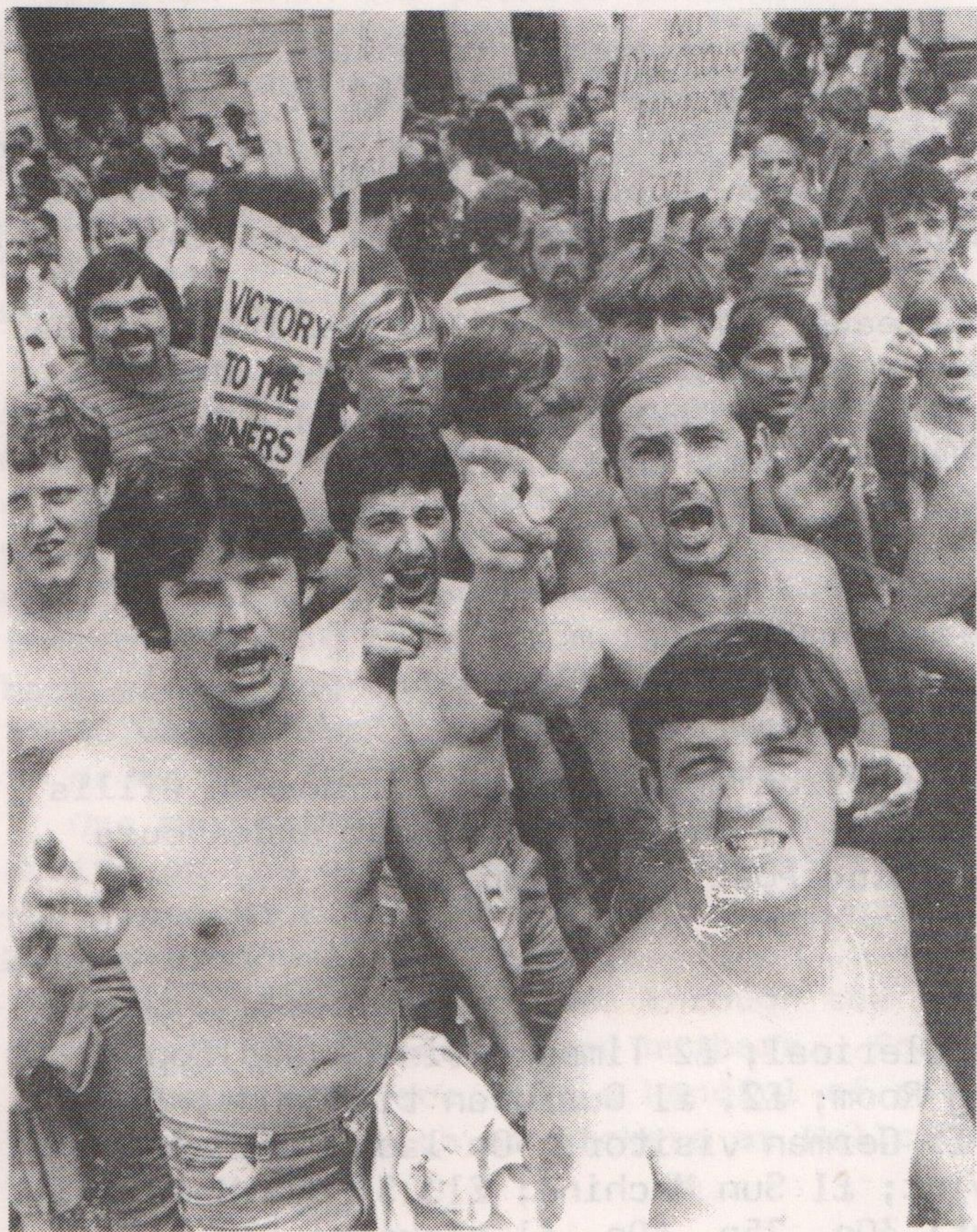
June 1984: angry march through Fleet Street

Picket reply: The pickets are the leadership in the strike. The pickets are the guts of the working class struggle. For twenty-two weeks of picketing printers and supporters have stood up to a vicious cop strikebreaking assault, and fought back without much support. Extending the strike will be done by picketing, not as you outline it. And it is necessary to link the strike to other workers. Ours is a common struggle.