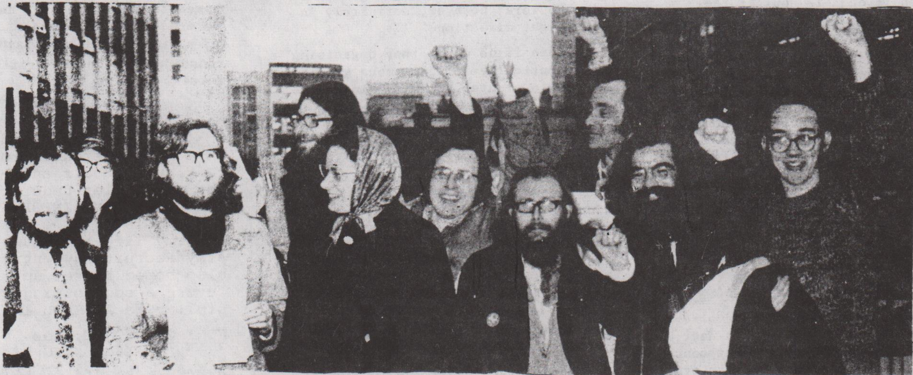
Some of the 14 outside the Old Bailey just after they were found not guilty on all 31 charges

This is shown by the situation in Portugal; there, many soldiers have realised they have a common interest with other working people, and are fighting with them to try to take the power away from the few and create a more equal society. That the British authorities are aware of this is shown by the frequent references to the Portuguese situation by the prosecution at the Old Bailey.