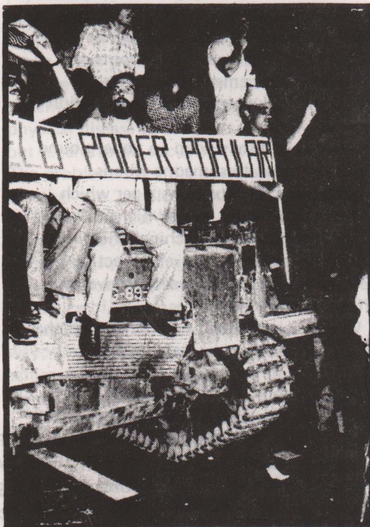
Soldiers and workers in Lisbon on 17 July:

"The TAP workers are not going to let themselves be fooled by anyone, and we are quite aware that capitalism still continues and that our struggle cannot be limited to the TAP or even to our own country. We also know that a real revolution is only possible where society is totally controlled by the workers themselves, and which the power of the state can never be used