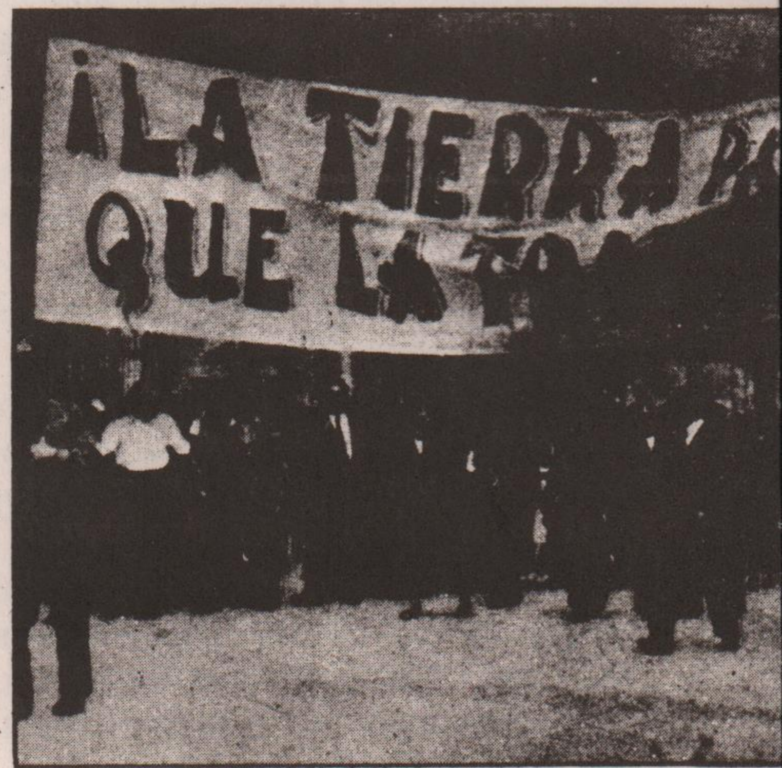
ABOVE : 1936. "LAND FOR THOSE WHO BELOW : 1976. Police in action in

Spain today is the scene of great conflict. Workers' liberties and better living standards. The achievements of these past struggles will have to be learnt. The following is the fight of the Spanish working class over the last