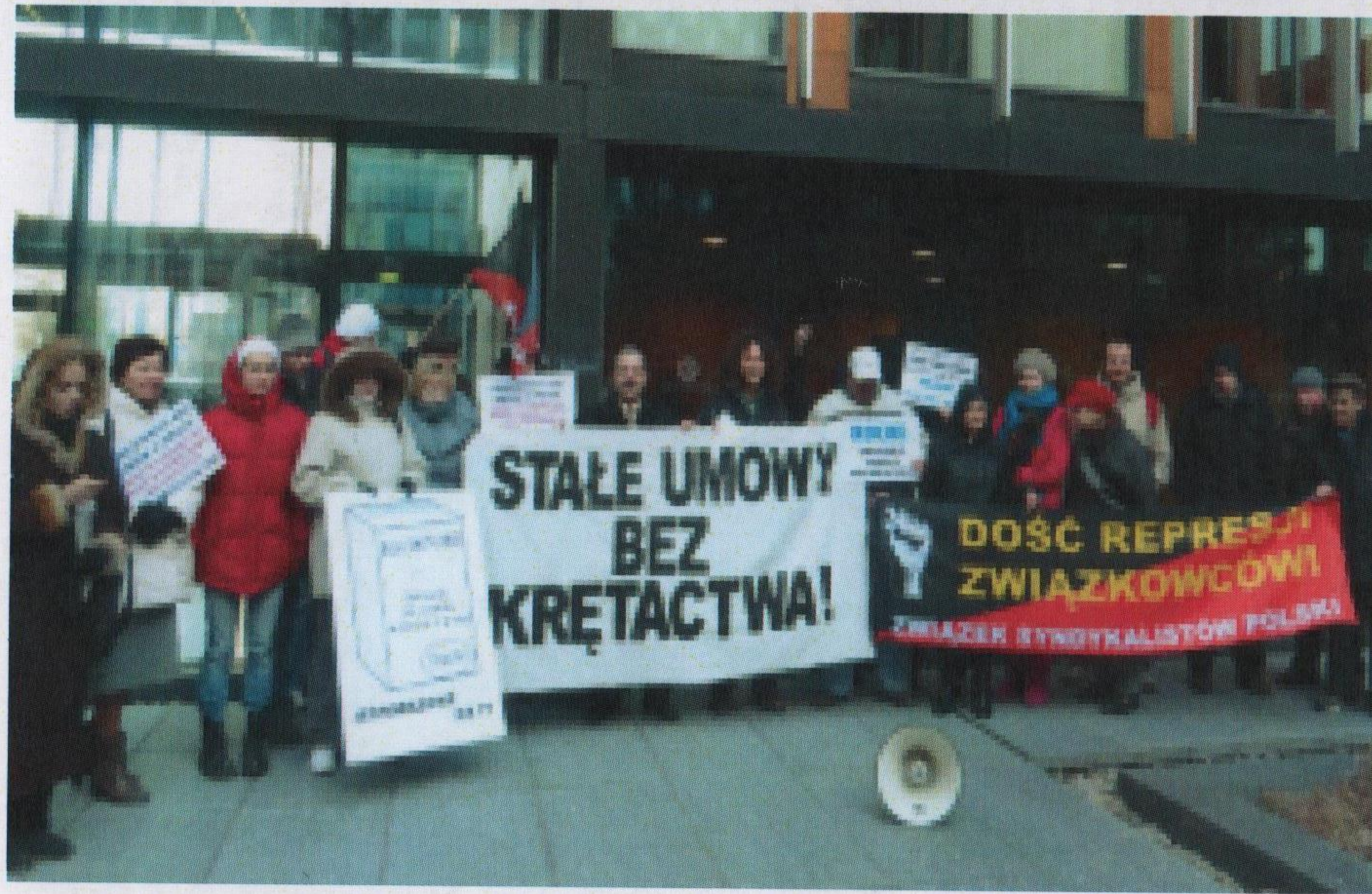
Picket at Roche Poland.