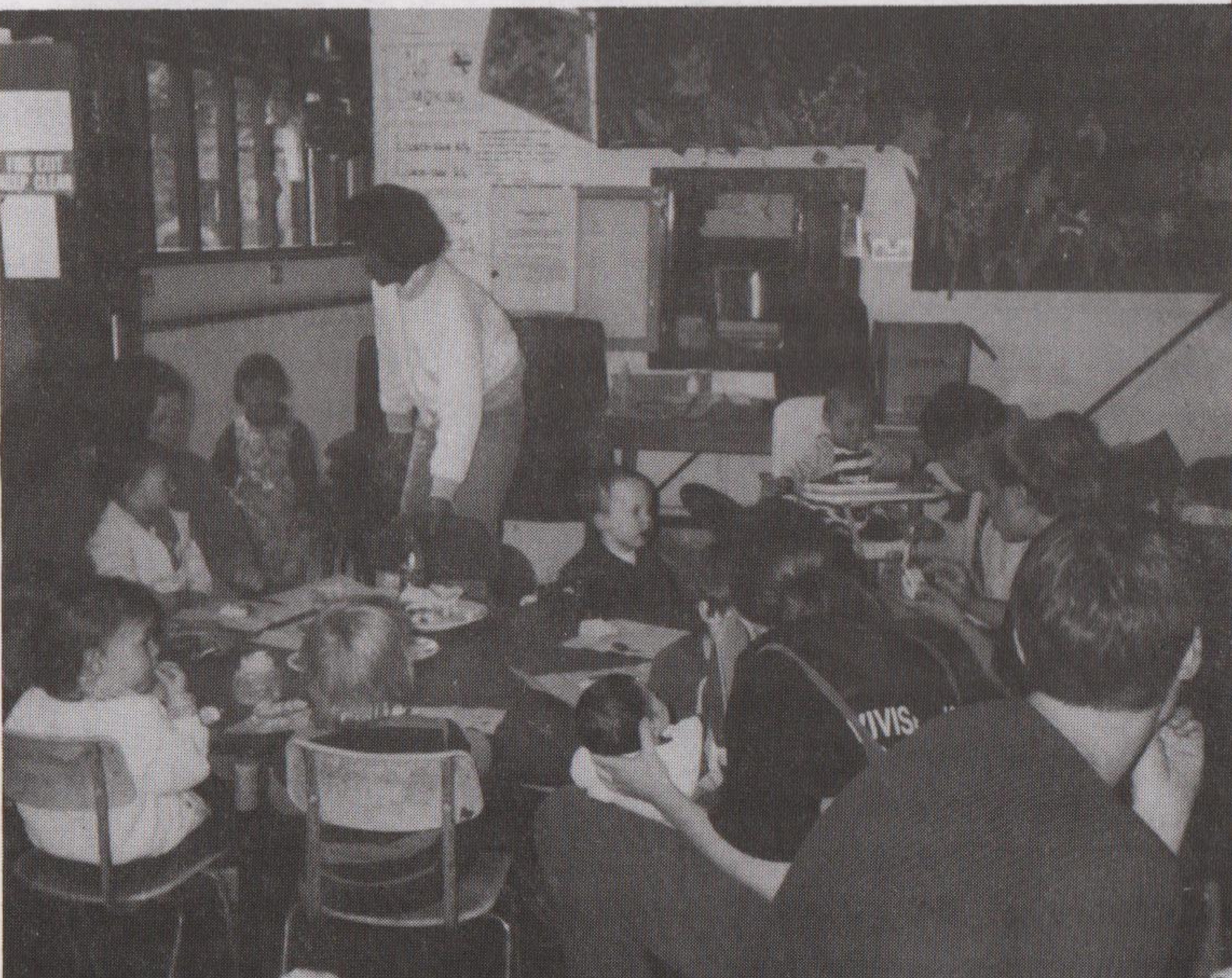
Lunchtime at Burghley Road

Centre is on Tottenham High Road nearly opposite the Spurs football ground. Again the cost is 50p a session and 20p for tea/coffee. All the money goes into running the centres. Nobody takes any wages but all are happy to put time in for free as they know there is no boss telling them how to do it. Both are examples of people taking control of their lives and surroundings without the interference of bosses, M.P.'s etc, and we are more that willing to publicise any such activities as long as they don't discriminate against others from our class.