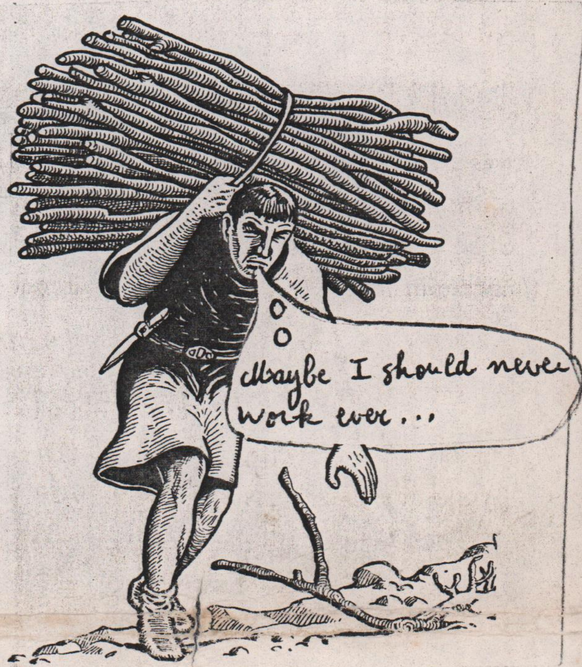
A Right to Work campaigner on his way home.

The Thunderer was the original name of what has now become The Murdock . On the left is a report from a time when news was news. But now newspapers and magazines, in Britain, worth reading are very few; we will name one: The Sprint .