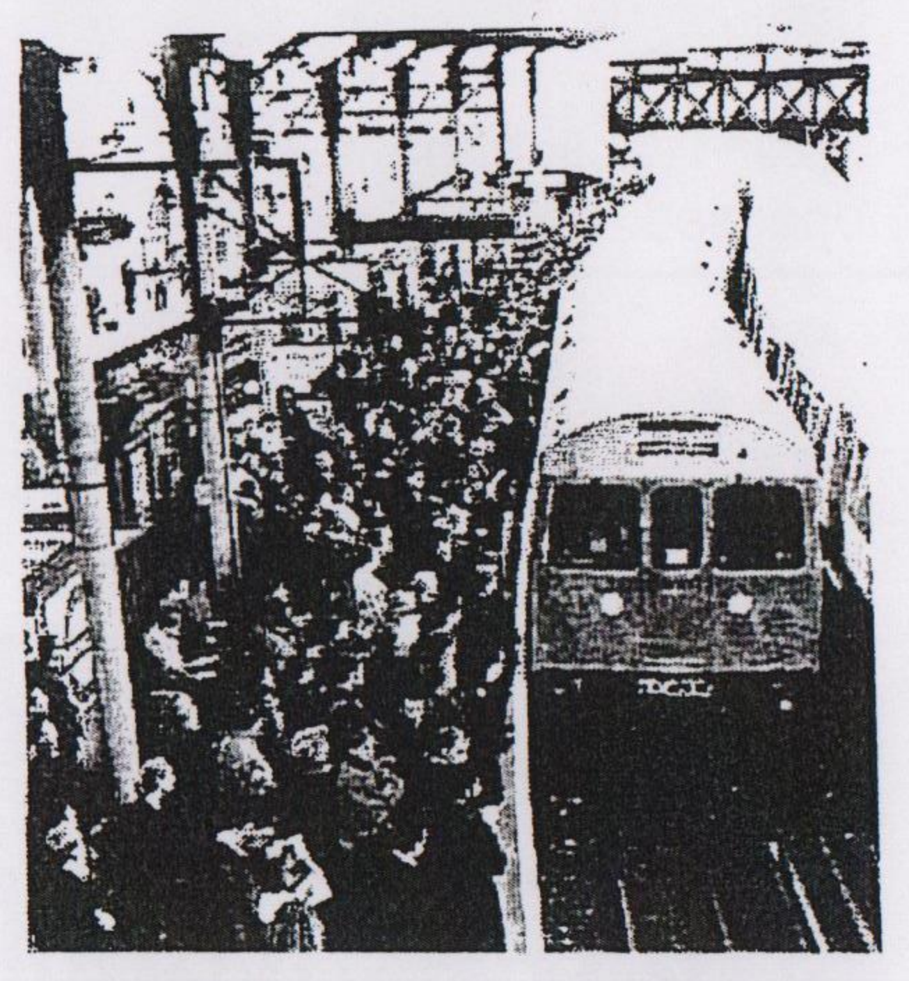
something must be done to force the Government and Tube bosses to stop privatisation, put some money into it

There is a massive groundswell of opinion by both Tube workers and passengers that