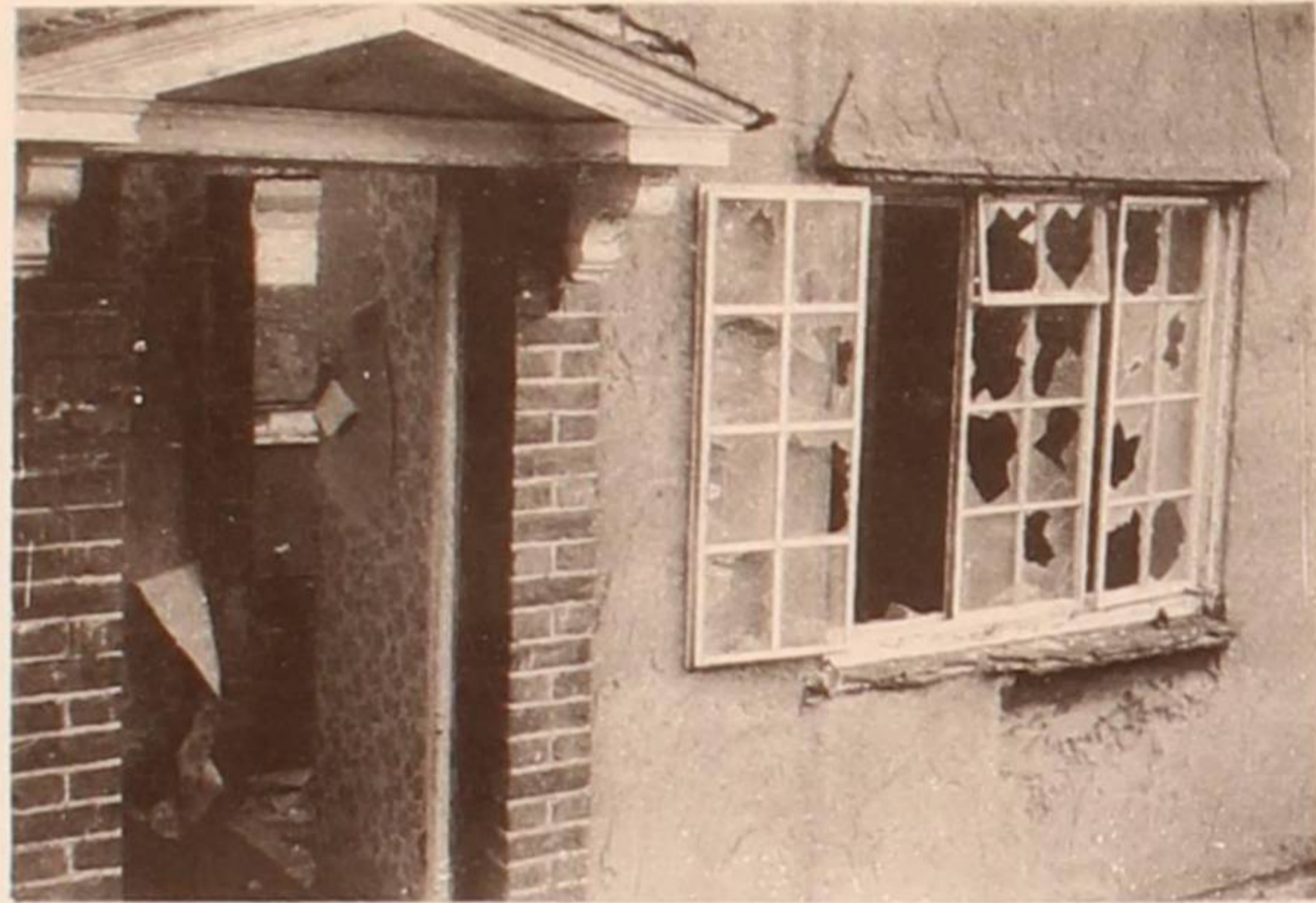
Demolition in Whitehawk. But will they build all the new houses they have promised? Even if they do there will still be far too few council houses in Brighton.

If you suspect you are not getting your rights in any of these respects you should contact the local Citizens Advice Bureau, Rights Centre or council office. It is absolutely illegal for the landlord to retaliate or threaten you in any way.