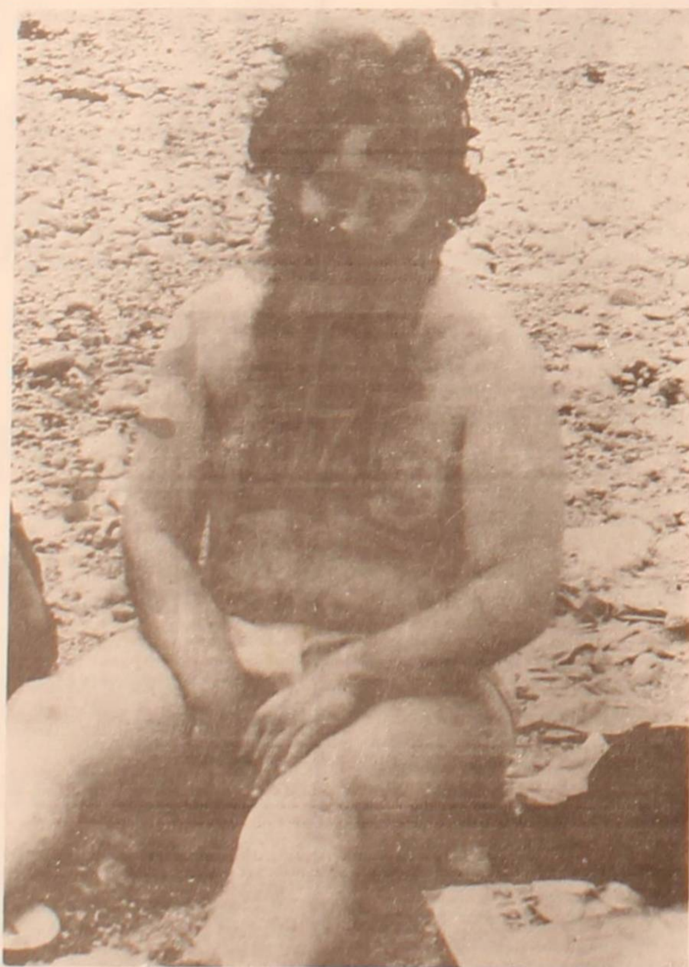
Our Founder Which Art In Paris.