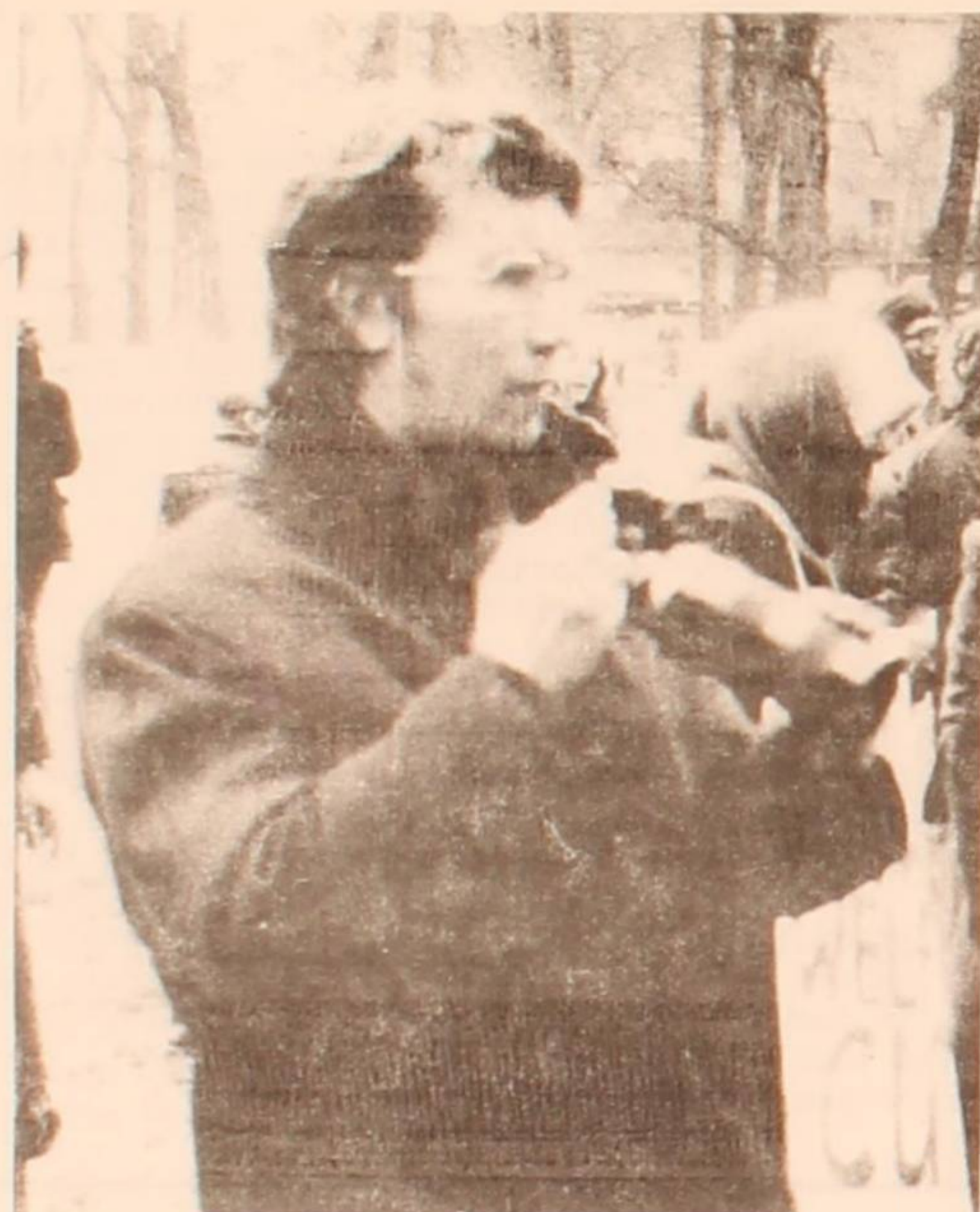
The new Sussex NCCL Group is very interested in the activities of this man. You should be too. For the reason why, turn to page 16