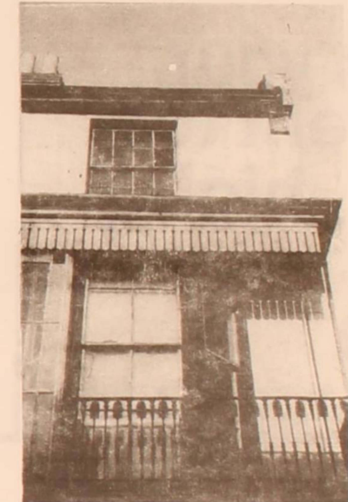
See caption to photo in the centre of the page.

By the late 1960's well over half of this local authority borrowing was from the private capital market and in 1974 £1,209 million in interest alone was paid by local authorities to these private lenders (enough to save Chrysler jobs eight times over and to pay for countless houses, hospitals and schools). And what is this private capital market? Our old friends the banks, insurance companies and pension funds. For one bank (Lloyds) profits increased by 1042% between 1964 and 1974. Do you feel angry now about your latest rent increases now you know where the money goes to?