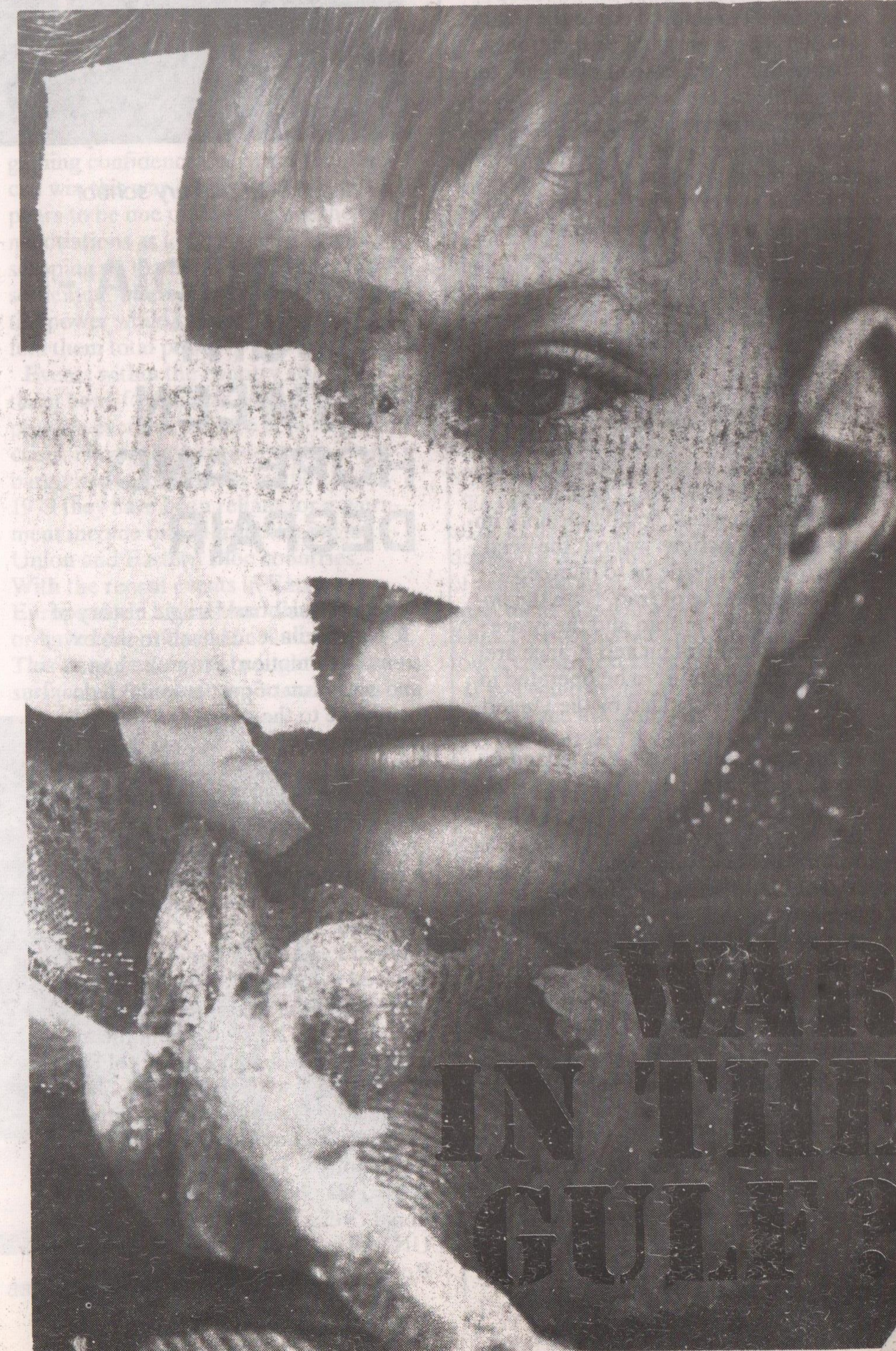
CND's leaflet on the gulf crisis