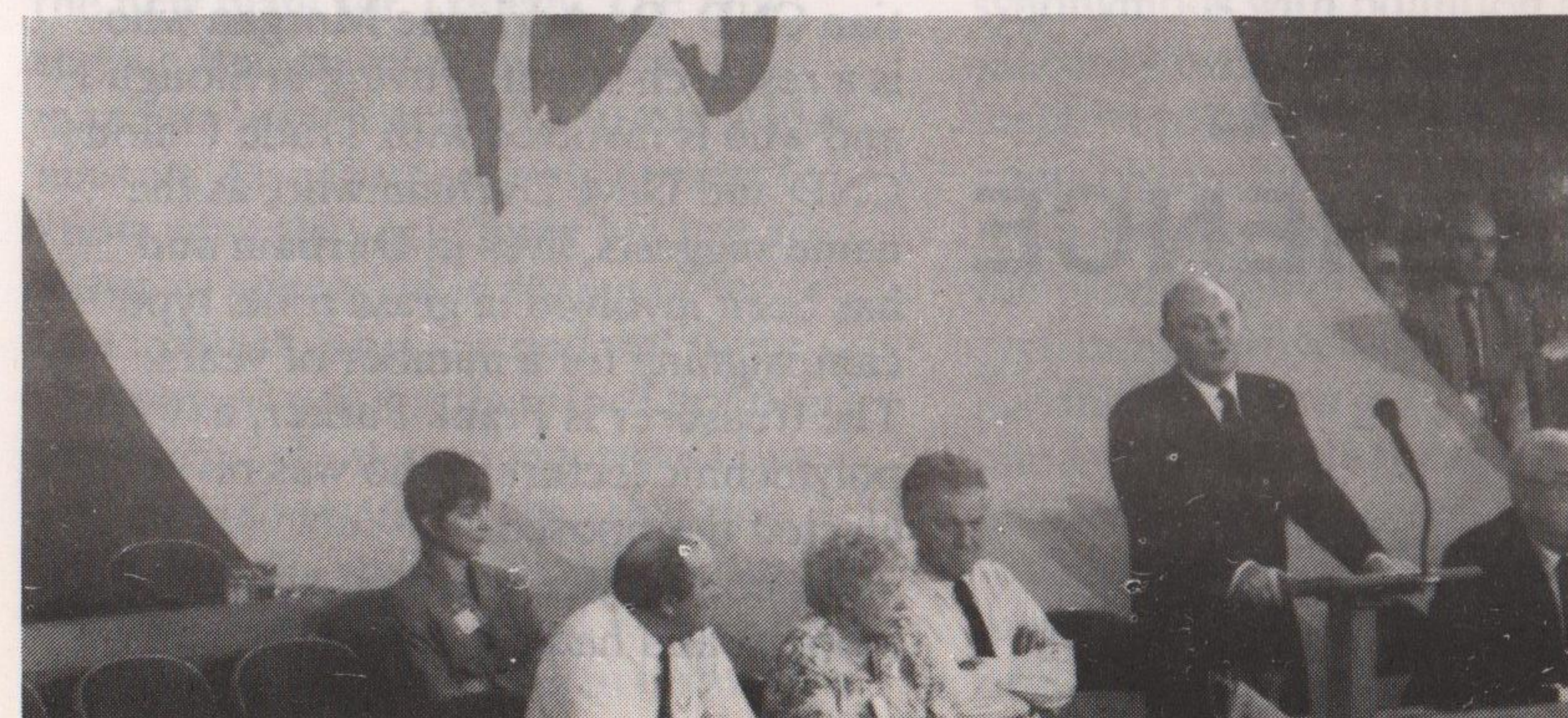
Neil Kinnock addressing the TUC

The policy passed at the Labour Party conference has a rationale which is unavoidable. The motions passed this year argue for channelling money in the initial stages into our manufacturing base. If that happens we will see an increase in the GDP, reduce unemployment and decrease the balance of trade deficit which in turn could reduce the inflationary spiral our economy has been locked into for a number of years. There is no way round this for the Labour Party. It is the policy it will have to adopt if it gets into power.