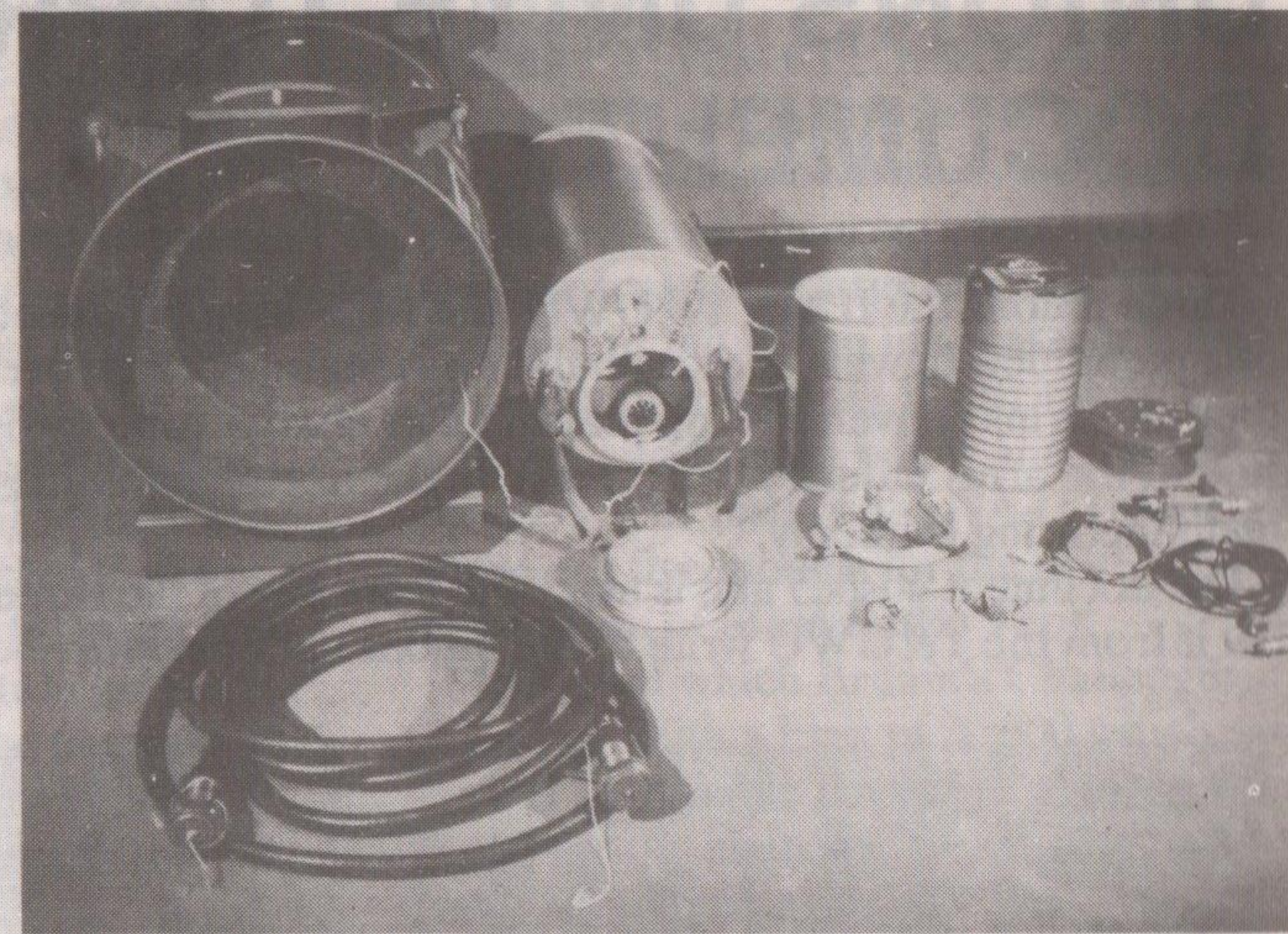
Medium Atomic Demolition Munition (MADM)

Making the management of nuclear material a commercial concern is a very dangerous step indeed. It could be argued that this system delayed the production of weapons in the US and