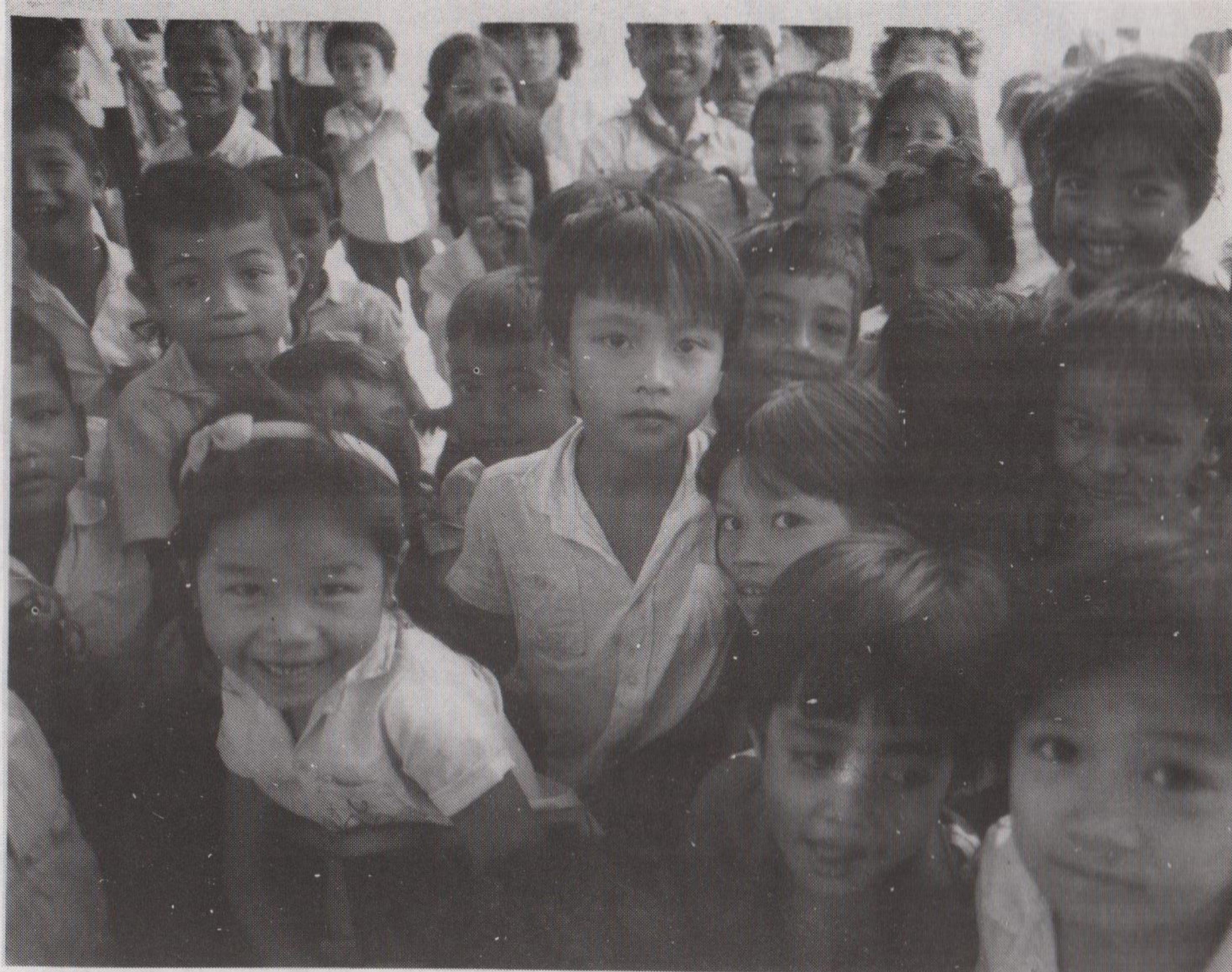
A Phnom Penh primary school

If you would like further information on CND's campaigning activity against this potential war, contact the national office.