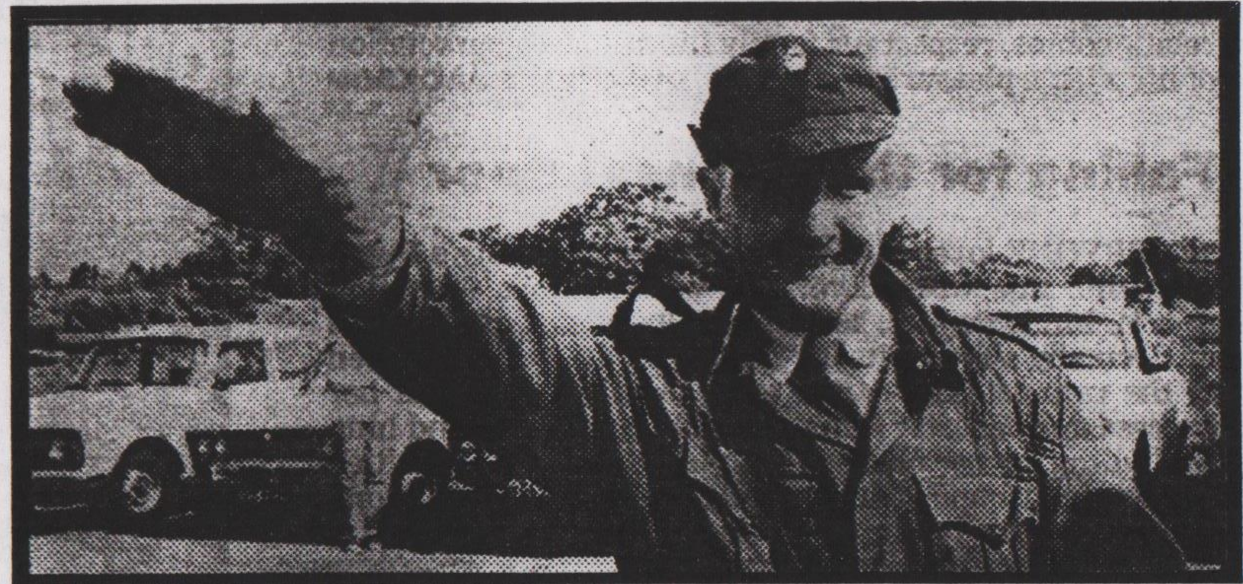
One of the many SS Latvian fascist organising open fascist units as part of official Latvian Army

One thing is certain - the fascist revival in Latvia is not in isolation. Lithuania, another Baltic republic, on gaining independence immediately pardoned tens of thousands of war criminals. All over Eastern Europe it is becoming an honour to have been an SS man.