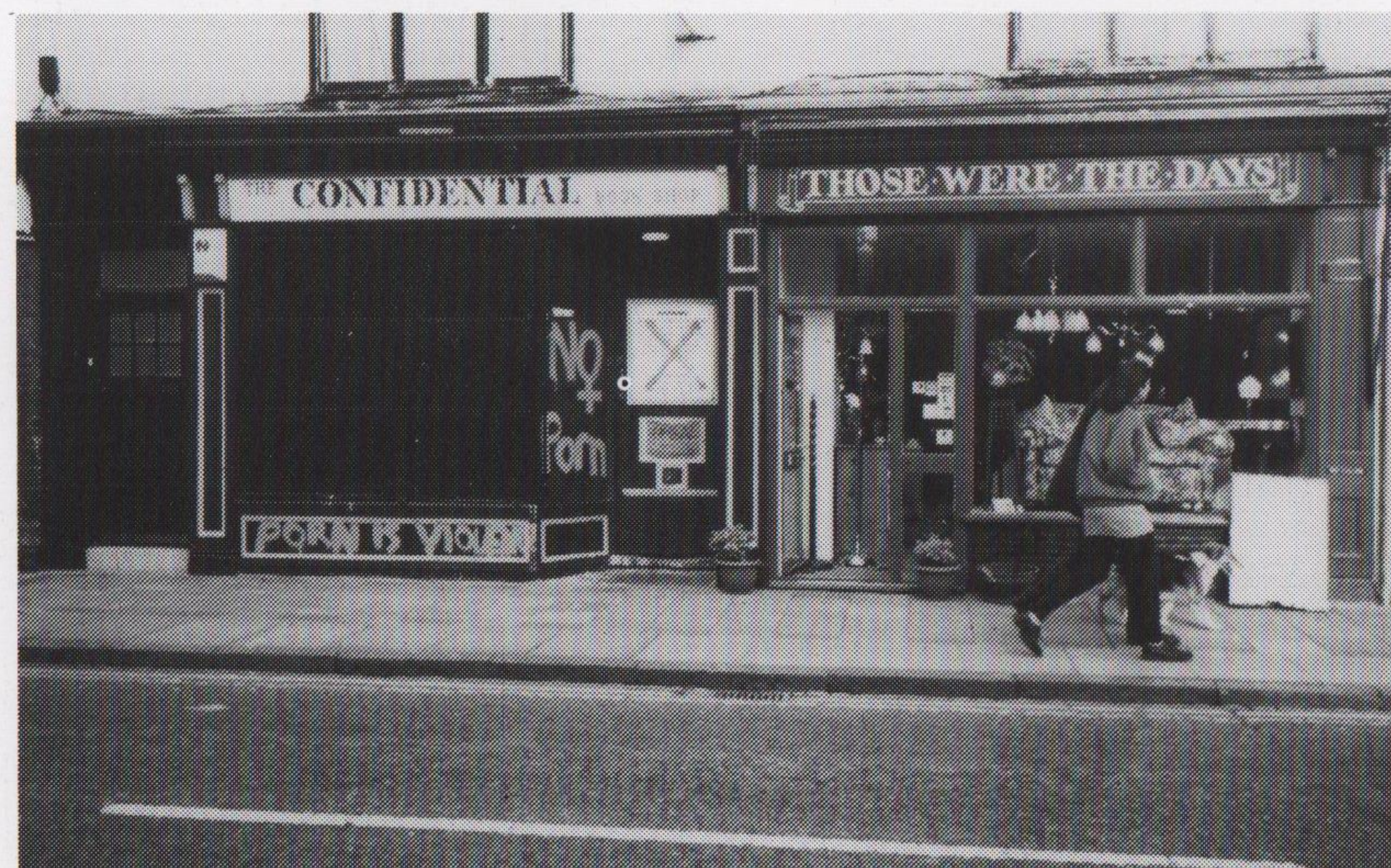
A Cambridge local porn shop repainted recently. Looks like the Killer Feminists from Hell are still around somewhere!

■ If you would like to start a CAP local group in your area, or would simply like to get in touch with other local CAP members, contact the CAP office and we can put you in touch.