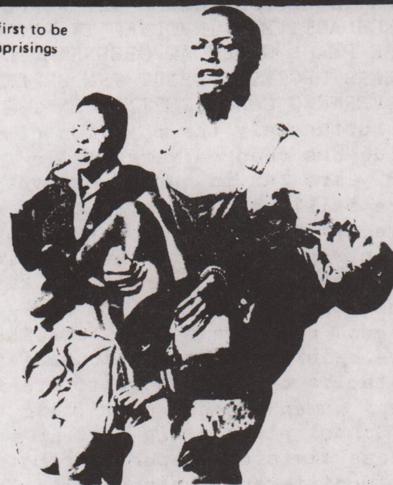
Hector Peterson - the first to be killed in the Soweto uprisings 16 June 1976