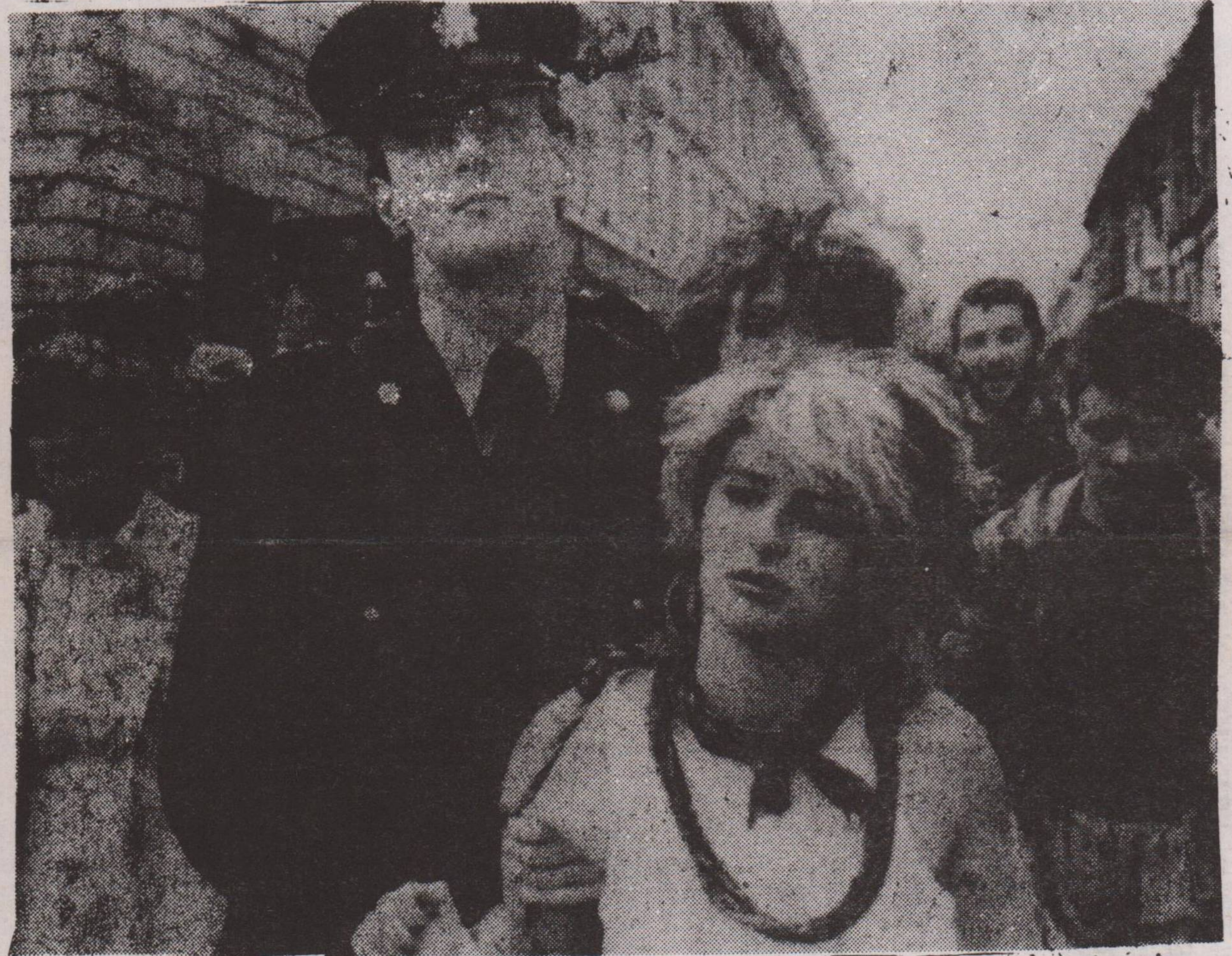
STRONG ARM OF THE LAW