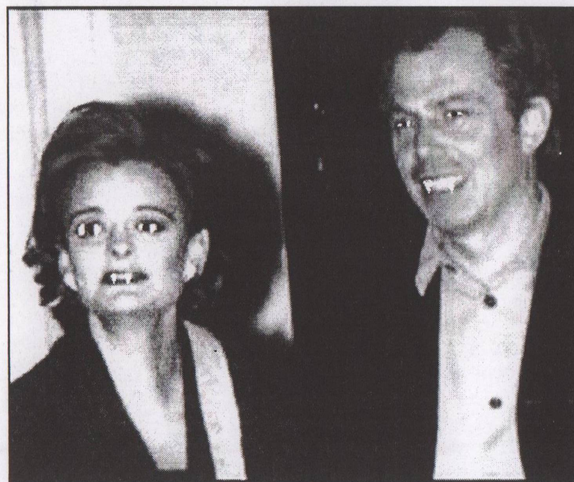
Ruling Class Blood Suckers

The government has shown itself to be what anarchists have always said about previous Labour administrations - a sweet little pussy cat for the bosses and a vicious yard cat with sharp claws for the working class. The way Labour has shaped up is no surprise to anarchists. We have never called for a vote for Labour - unlike the left who when it comes around to an election ditch their fake anti-Labourism. We never doubted that this government would be not afraid to use authoritarian methods faced with any sign of dissent. In fact, we said that the election of a Labour government was looked on with pleasure by many sections of the boss class. The Tory administration was discredited, and a change was needed to restore confidence in parliament and the other British institutions. The old creaking structure of British society needed a few reforms, but not too many! These included a ditching of the House of Lords, a reformed (but not abolished) monarchy, concessions to the Scottish and Welsh