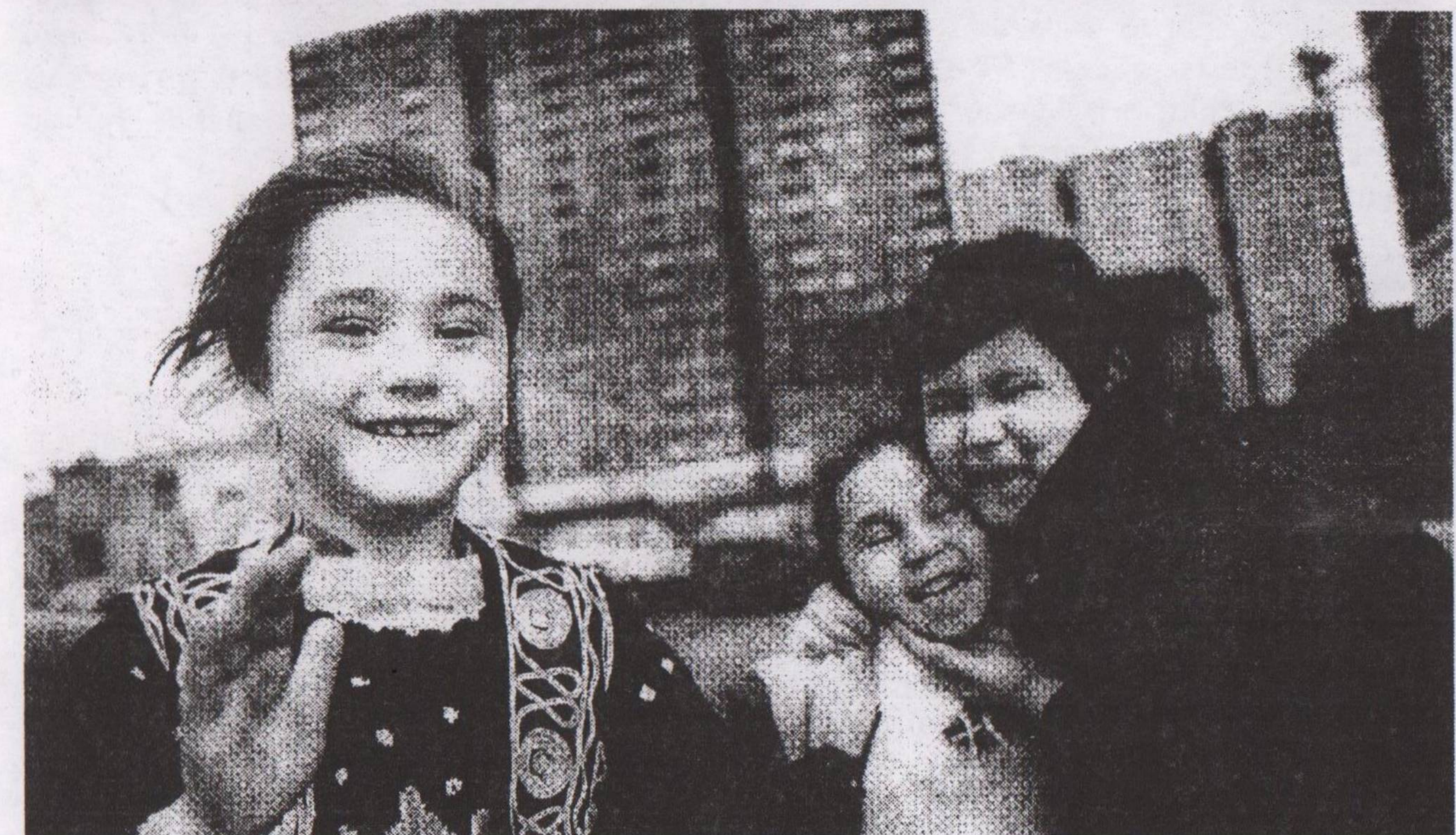
No, not these Roma kids in Glasgow, the real scroungers are the ruling class.

The media and press have been having a field day about refugees, particularly Roma: claiming that they are 'swamping' the country, part of criminal gangs, and demand money with menaces; they cynically have children with them when asking for money to exert moral blackmail (perhaps beggars should put their children in a creche?). They are also called 'benefit cheats' claiming money when they have jobs, and are said to be jumping the council housing queue.