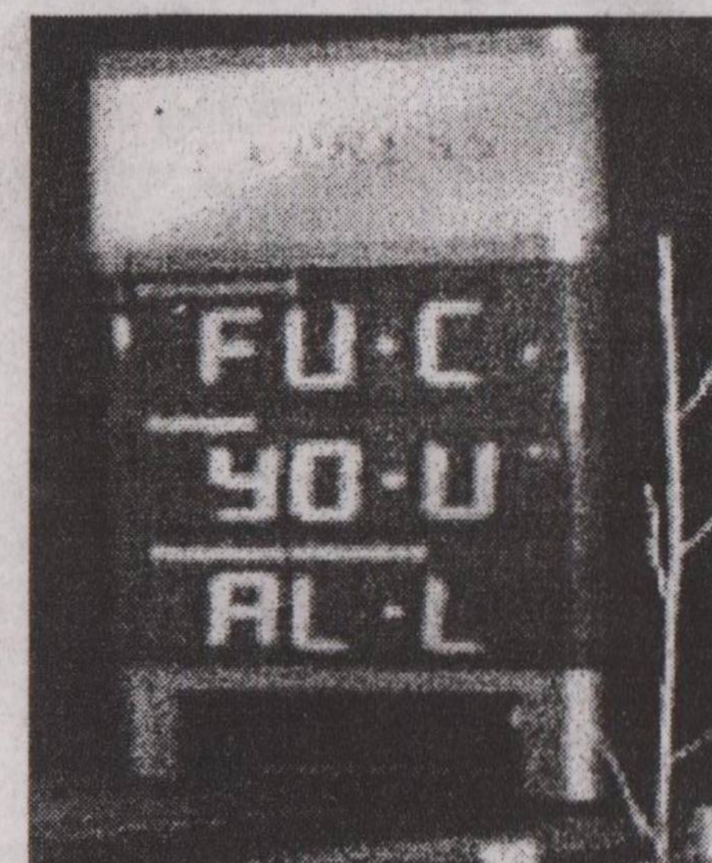
A message from the petrol companies

Last month's petrol crisis has certainly shown this arrogant government of ours that even the most popular of administrations can be rocked by effective direct action. Cutting off the petrol supply quickly ground the country to a halt - something to remember for future struggles! The irony of the "blockade" of petrol refineries and depots by road hauliers and farmers is that this direct action was not carried out by militant workers but by small businessmen. The workers have largely forgotten the effectiveness of direct action, mainly due to manipulations of union bosses (who, incidentally, roundly condemned the threat to the government). Why was this action so effective? The answer lies in the temporary coincidence of sections of all Britain's classes which each had something to gain from a cut in petrol taxes. The working class, largely supported the hauliers action since many of them own cars and welcomed the opportunity to save some money. Petrol taxes are unpopular. The farmers, who are already massively subsidised out of taxes saw the opportunity to join with road hauliers to gain even further cuts in costs. The road hauliers too saw the chance to increase profits and realise their financial self interests. The capitalists sought to gain from a cut in petrol taxes to maximise their already massive incomes. This explains the ease by which a handful of blockades stopped fuel distribu-