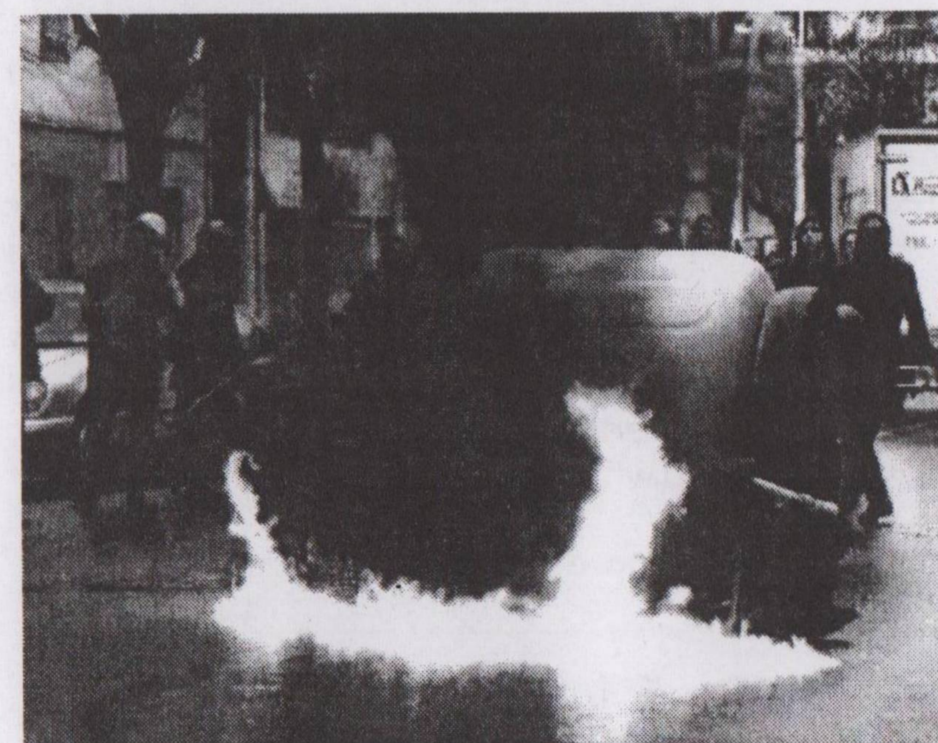
More gratuitous rioting pictures

On the 6th of December the latest fashion for disrupting meetings of the rich and powerful (as seen in Birmingham, London, Seattle, Prague, etc.) was extended to include European Union summits. Around 70 000 people gathered in the French town of Nice, the day before the opening of the summit. The majority of these people were trades unionists, with smaller numbers of anarchists and leftists also present. A short and dull official march took place, most trades unionists seemed happy that their symbolic demands for greater reforms had been heard, though thousand of activists had more radical plans... 1 500 Italians that had tried to get to Nice by train were blocked at the border, which lead to thousands of demonstrators to occupy Nice railway station after the official march and demand the border was opened. The riot police reacted by attacking the demonstrators throwing them out of the station. Sporadic scuffles then took place in the centre of the city.