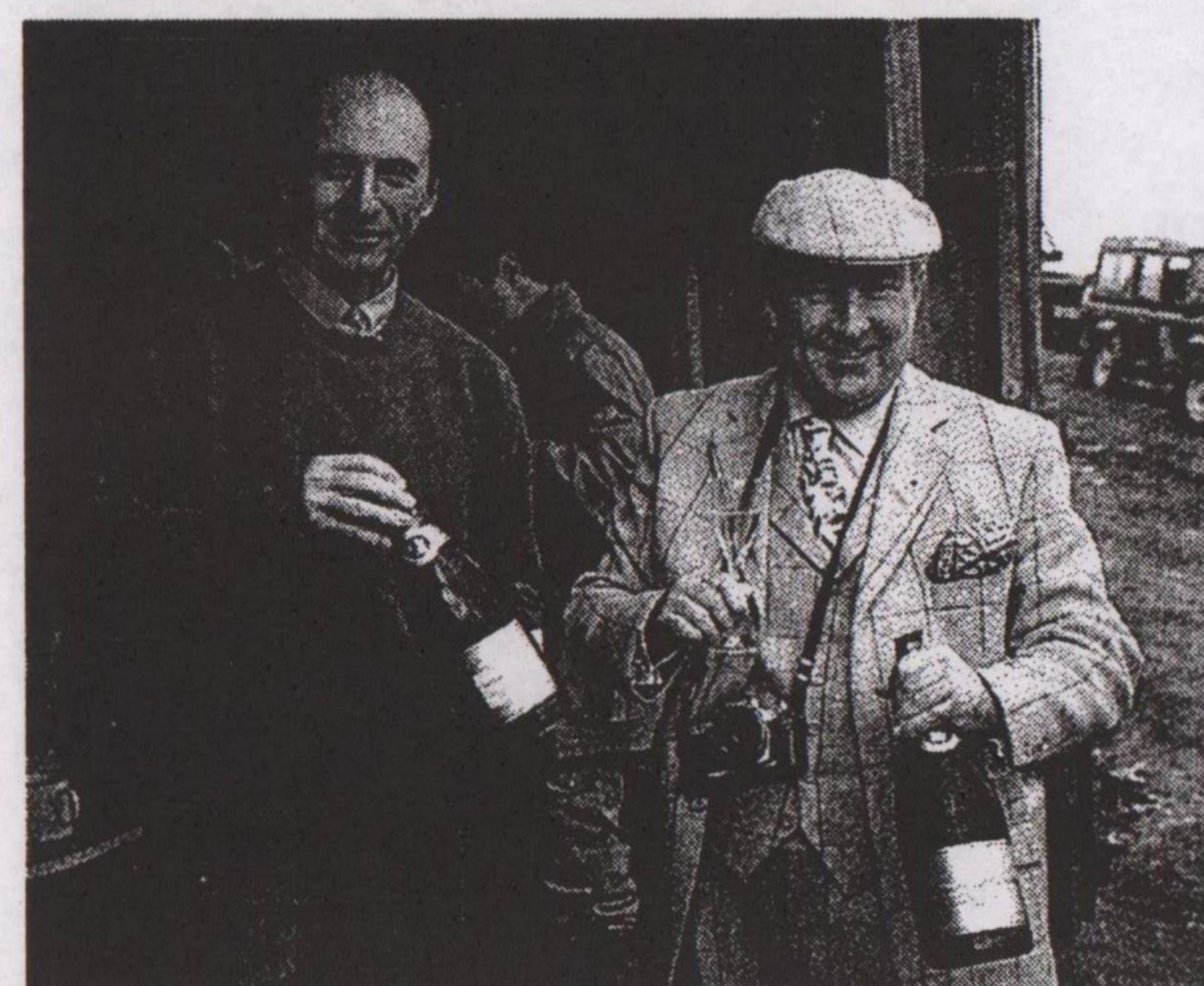
Typical country folk?

Though they decided to cancel this month's march, the ruling class have merely postponed their display of force 'til early May when their massed ranks will descend on London; disguising itself as a march from the 'countryside'. It is also supposedly a march about fox hunting. This is what many of the anti-march protesters will be focusing on. But this is a mistake. Though this may be one of the issues, the march has a wider agenda. So what's it all about?