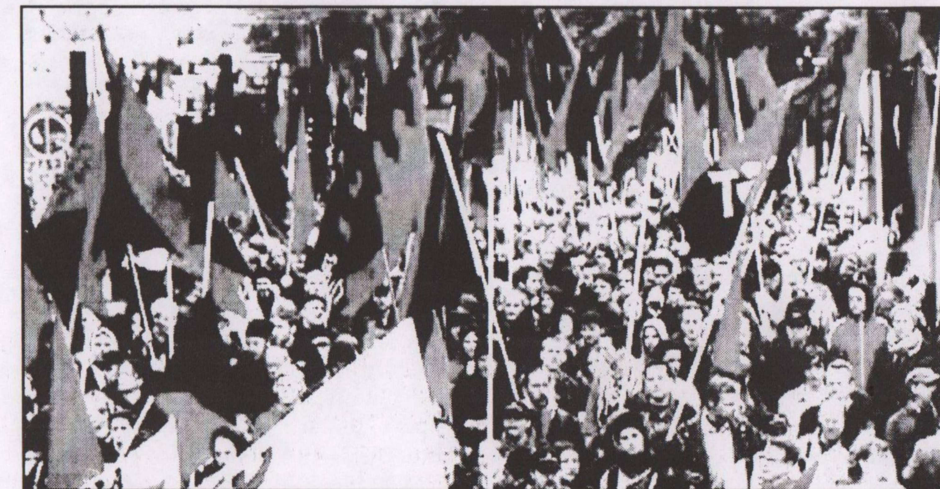
Black and Red flags on the streets: 1000s of anarchist militants swelled the crowds during the street-actions in Gothenburg, Sweden in June. Eyewitness report inside.

"It's all because of outside agitators. NF (National Front) and BNP coming into town to