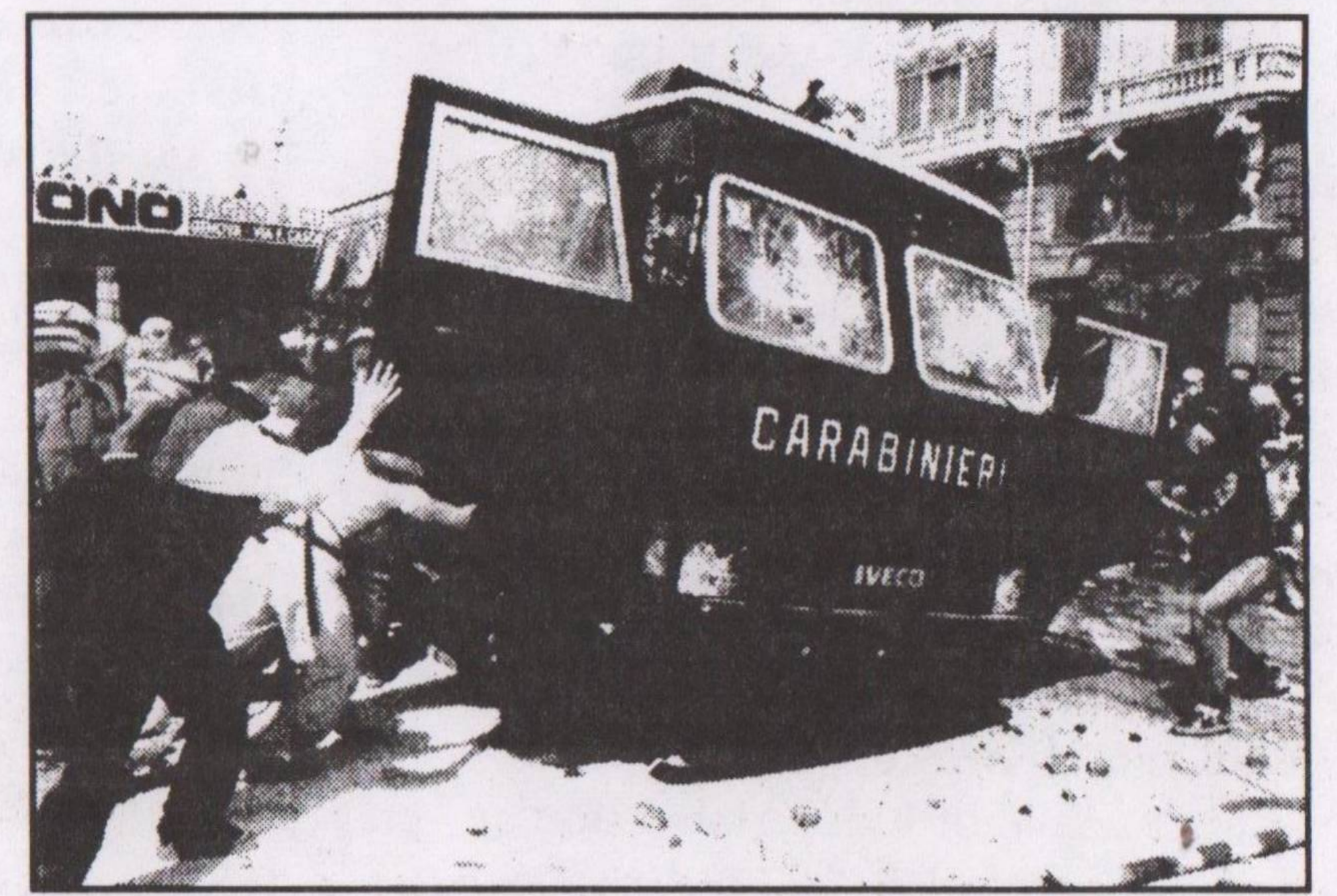
"Anyone seen the van guard?"

If we are here, we do not come as members of the numerous NGO's, official lobbies, ATTAC or the rest of those who merely wish to be included in the discussions over the modernisation of capitalism and who hope that their proposals will be able to save capitalist social relations, i.e. the same relations which perpetuate our alienation and exploitation.