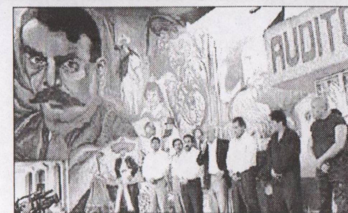
Captured officials paraded under a revolutionary mural