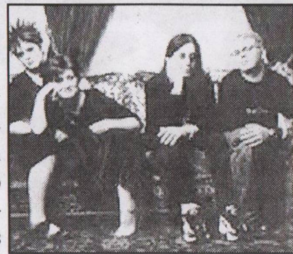
The Osbournes: Prats

HERE AT resistance we don't just pour scorn on all these vomit-inducing allegedly famous names simply because they are vain, shallow and transparent as a pane of glass. No, we do so because the money and publicity they attract highlights better than anything we could ever dream up the crazy, insulting, topsy-turvy (il)logic of what passes for life under capitalism. Take the dysfunctional Osbourne family for instance. Apparently in addition to the £14 million TV deal they've negotiated, they also demanded as part of their package free psychotherapy treatment for life for their pets. Er, psychobabble for cats