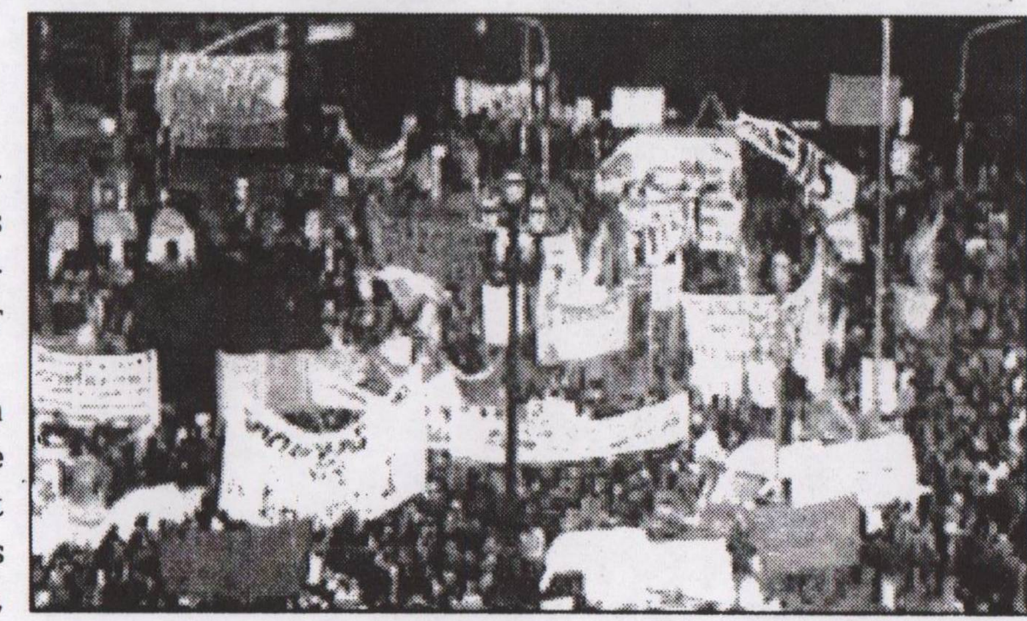
Argentinians fighting back

The implication of our debt is that our basic financial security is tied up with the success of capitalism. And the current chaos shows just how unhealthy that system is. The aftermath of September 11, the precarious state of companies even before that and a few financial scandals have meant that the whole bubble could burst any moment. This is, of course, what capitalism is about, not creating prosperity for the many but vast wealth for a few. If there is an economic crisis (a regular