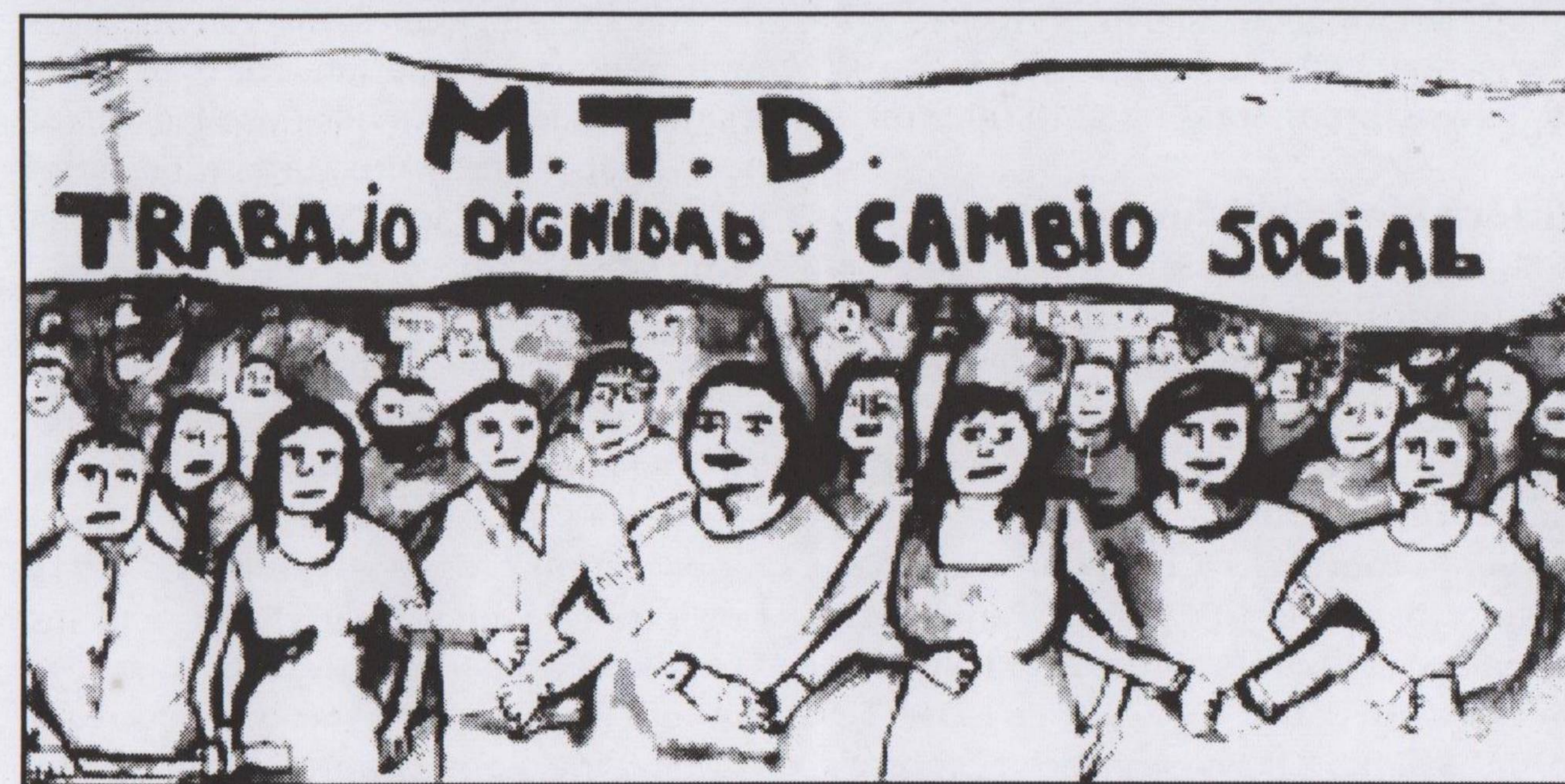
Drawing of unemployed workers calling for Work, Dignity and Social Change

THE ARGENTINA AUTONOMISTA Project have just finished a successful tour of Britain and Ireland. The tour consisted of an excellent puppet show telling the history of capitalism in Argentina and the resistance to it by the people.