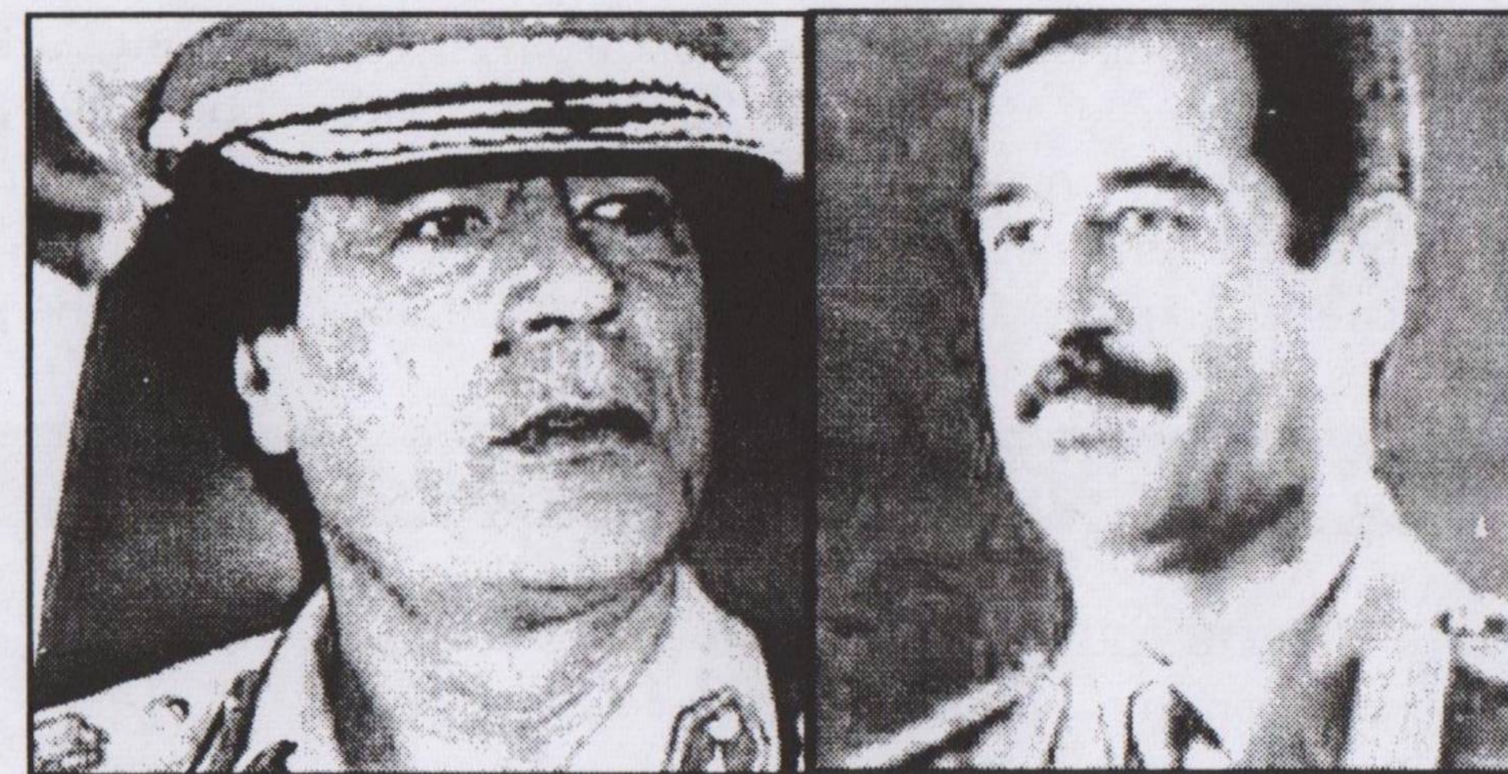
Spot the difference: An imprisoned tyrant and our new friend

YOU COULD BE forgiven for thinking that "The War Against Terror" is just an excuse for aggressive American foreign policy. Certainly someone needs forgiving judging by the range of excuses we've been given for starting the war on Iraq.