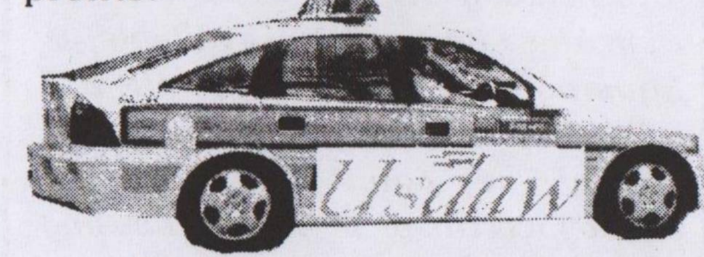
TUC (Trade Union Coppers): coming to a retail park near you? ★

This scheme is part of a bigger drive by the government, encouraging people to report on and police other working class people - not for their own safety but to save businesses and government money. If the workers were to target the real thieves, they'd target their bosses who pay minimum wage and reap huge profits.