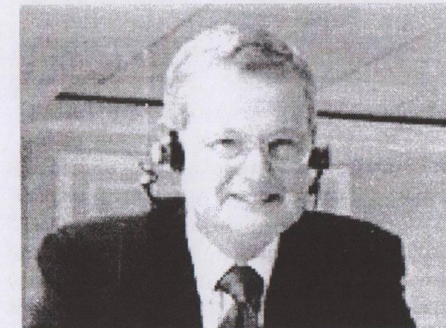
Gary Titley MEP. Does anyone seriously think anarchists would waste time on a fool like this?

iterates the clear condemnation of bombs, letter-bombs and similar methods, since they can strike randomly and indiscriminately, and also reiterates that these methods resemble more than anything else a plan of deliberate provocation leading to the criminalisation of dissent in the media, at a time when anarchists are already the protagonists of social struggle, of strikes, and of initiatives against the war.