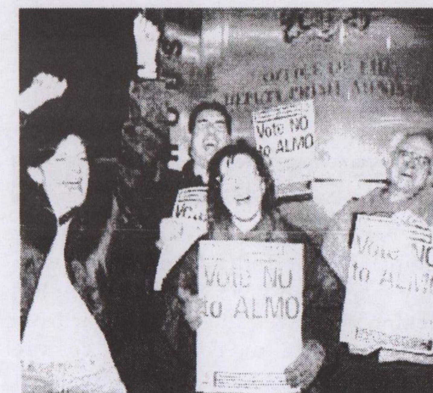
Some Camden residents celebrate their victory

The government has recently admitted that it plans to spend £800 million in 2003/4 subsidising privatisation by writing off 'overhanging debt'. This is just less than the £840 million available as housing investment for all 2.7 million council homes in England & Wales. They could almost double direct investment in council housing if they stopped privatisation.