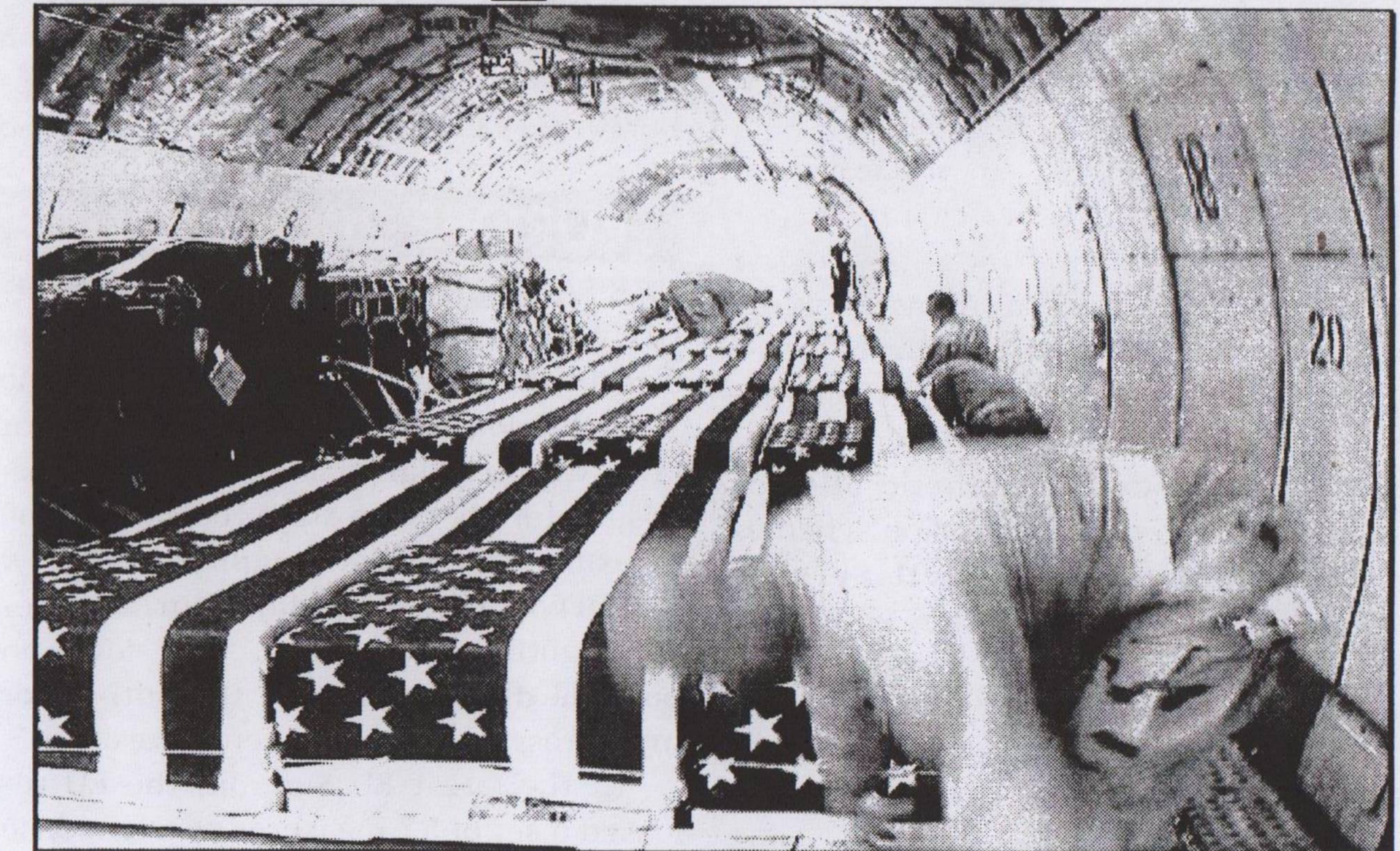
The scenes the US Army doesn't want you to see: almost nightly, coffins are loaded into cargo planes for burial back home. More inside.

Socialism used to be considered the answer but what have the various forms of socialism actually produced? Marxism has either produced brutal dictatorships over the working class or degenerated into pro-capitalist reformism. Of the former, China and North Korea are good examples of the "workers' paradise". If