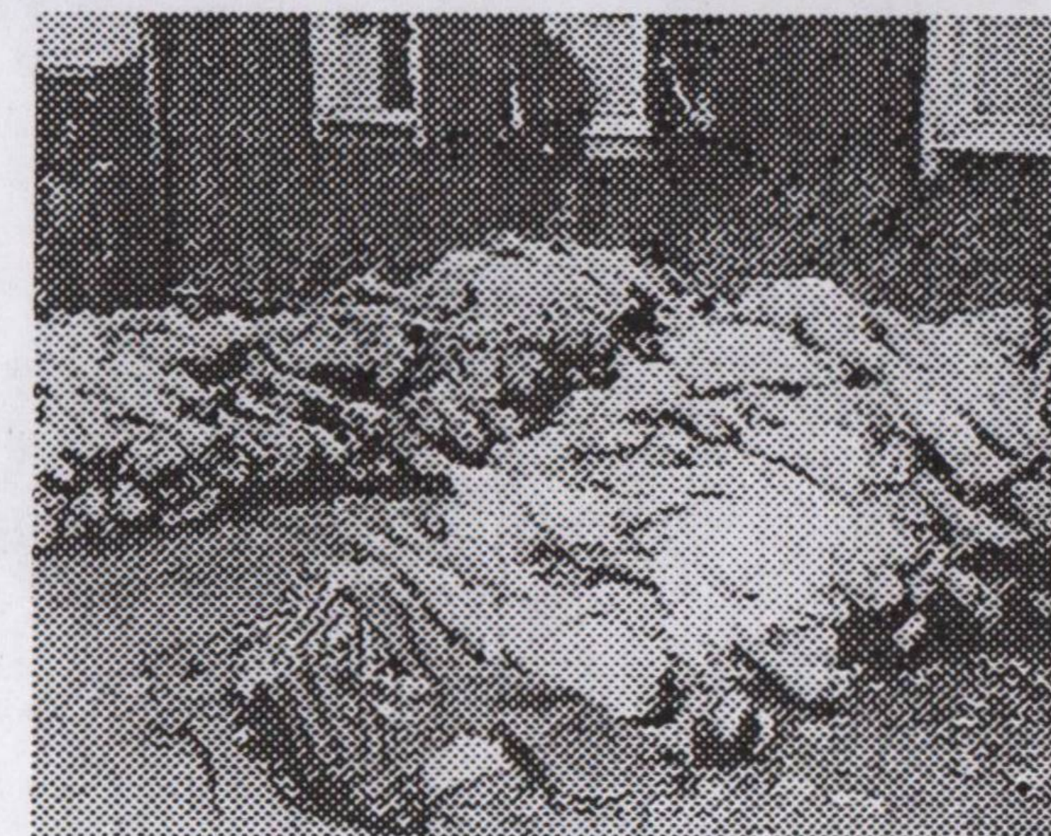
Fascism doesn't begin with the gas chambers, but that's where it ends.

Who is responsible for this rapid and widespread growth of racism? Blame firmly rests with Labour. The local Party was complacent and corrupt. But it was under Blair that mass racism in the borough was cre-