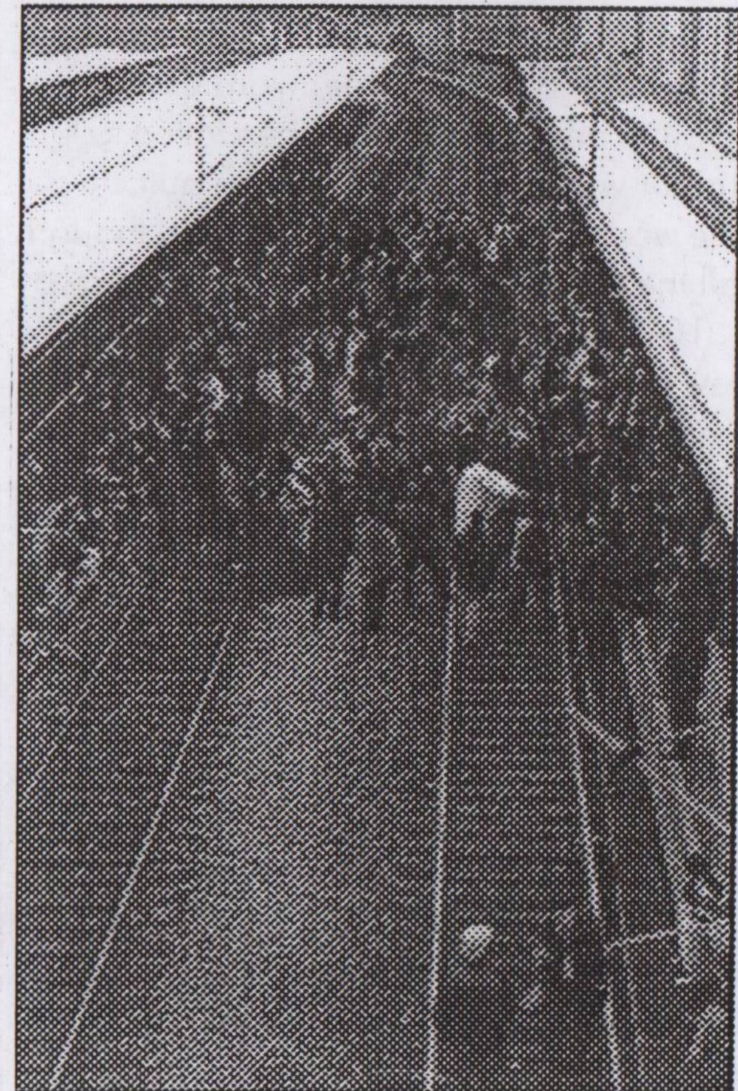
Station blockaded in France

and the humiliated government has been forced to pay massive subsidies (£104 million per year) to encourage firms to take on young unqualified staff.