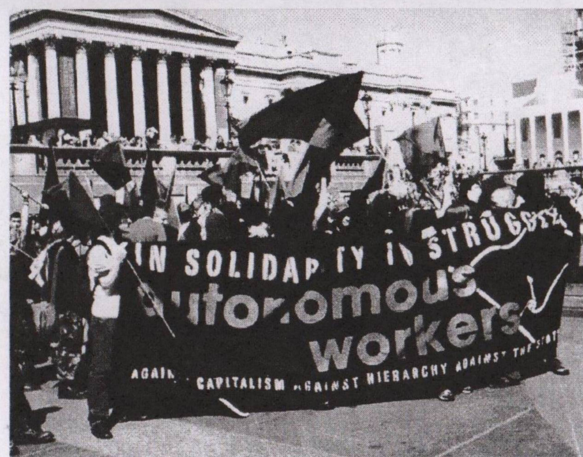
May day in London this year

There was international outcry and May 1st became established as an international day of solidarity and action by the American Federation of Labour, and this was supported by workers' movements, mainly in Europe. One hundred and twenty years later, this history has been conveniently forgotten. In the US, the State moved the date to September, and renamed it 'Labour Day', now known more for family BBQs on a long weekend than for any political association. In western Europe, it became the property of reformist political leaders and union bureaucrats and transformed into a meaningless ritual. Recently, some governments have