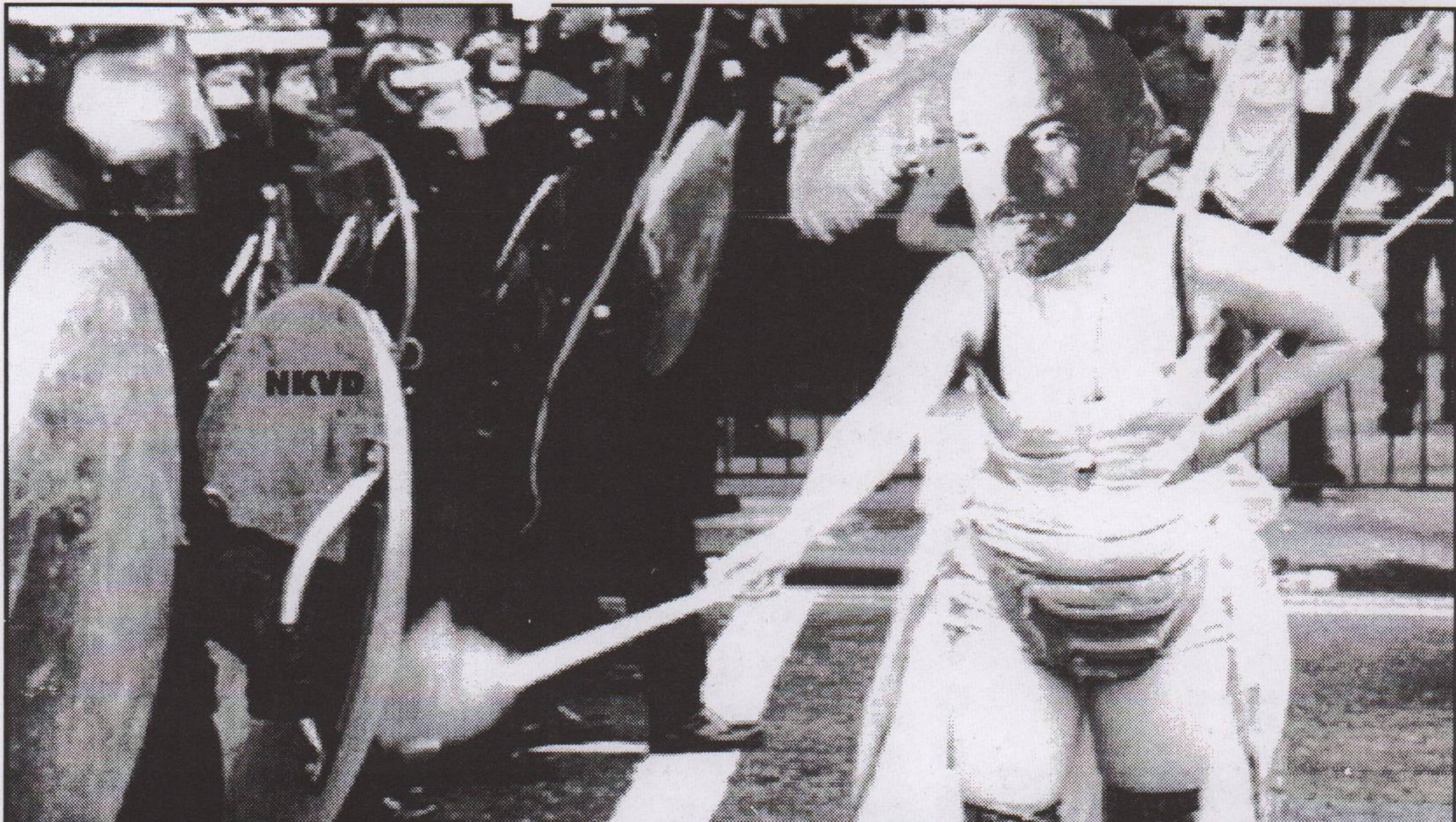
Lenin inspects the troops. Now they are ready to defend capitalism.

Make them feel part of Globalise Resistance by giving them some tacky shite with our logo on like badges or t-shirts. That'll impress them.