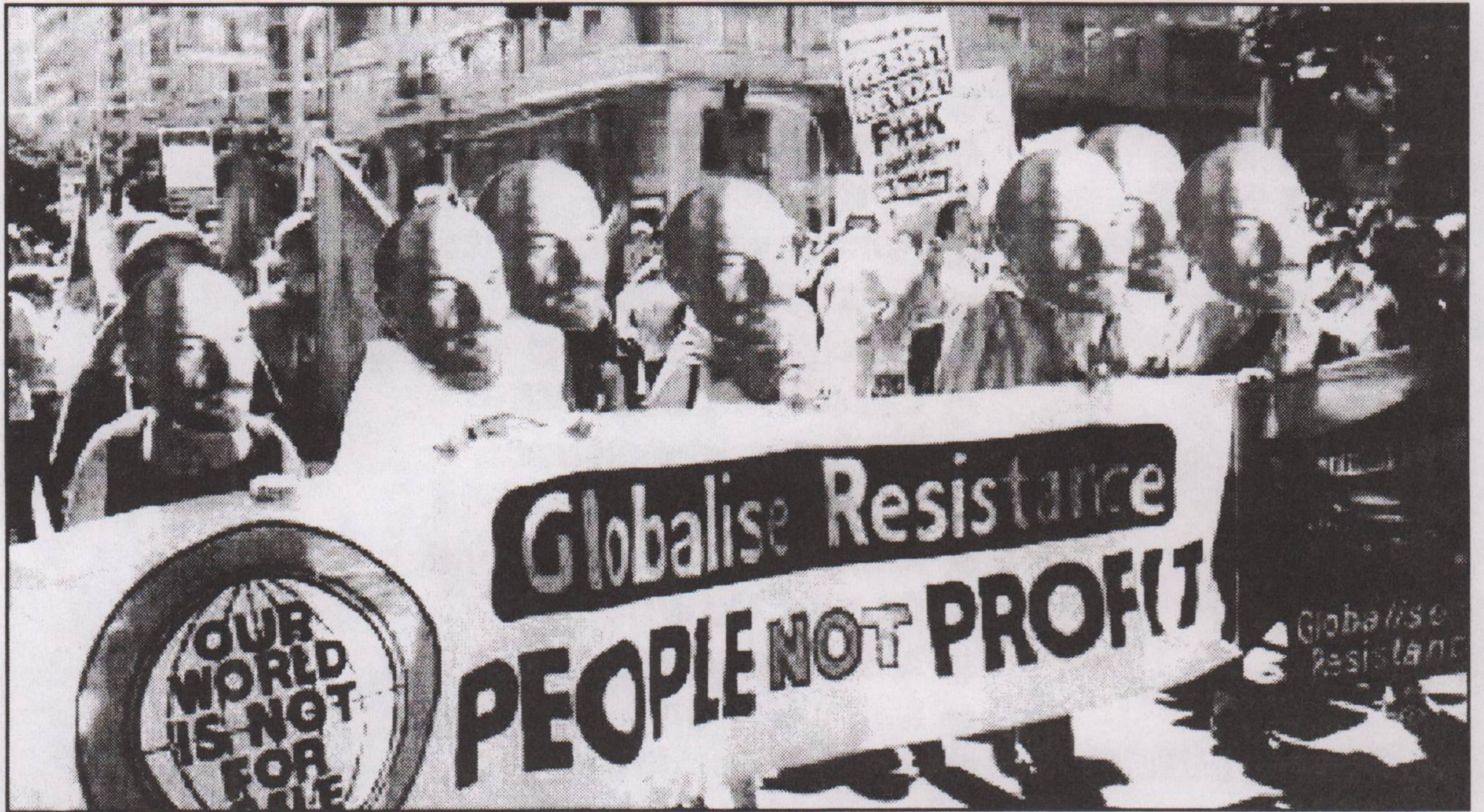
Globalise Resistance in Genoa - without the masks.