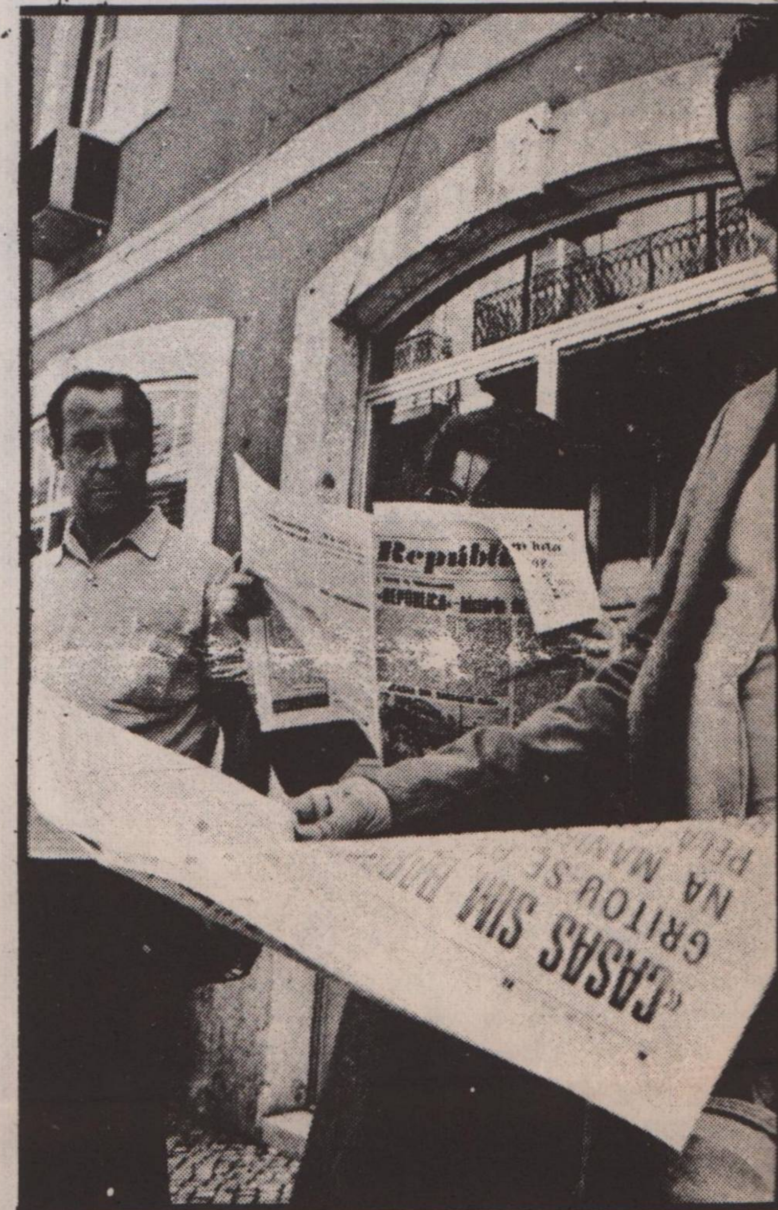
República — under workers control.

The constitution approved by the Popular Assembly shows that the truth of all this was reflected in the meeting of workers and soldiers. Amongst the objectives agreed,