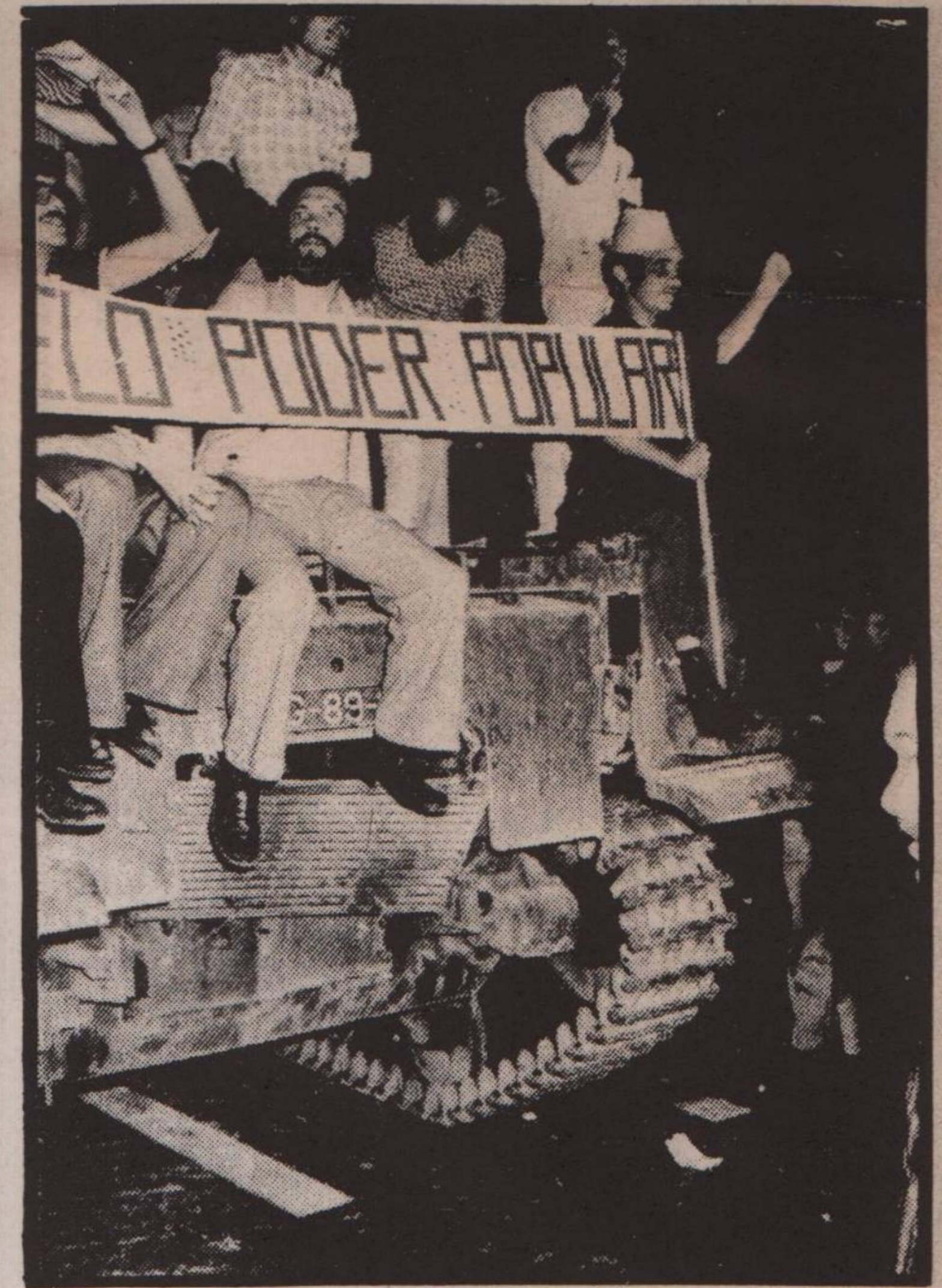
Soldiers and workers in Lisbon on 17 July.

some of the workers were members of Soares' own party, the Socialist Party.