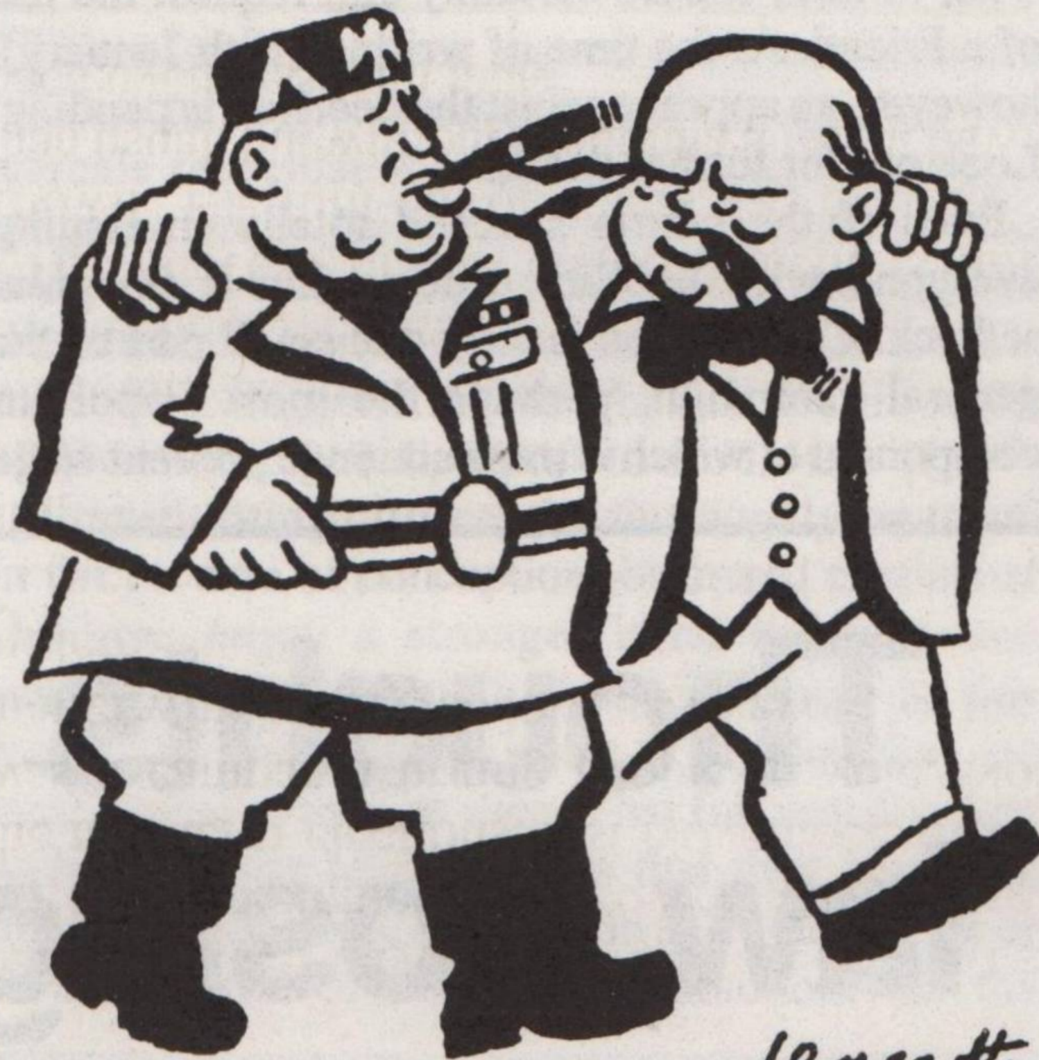
Fellow travellers, 1927