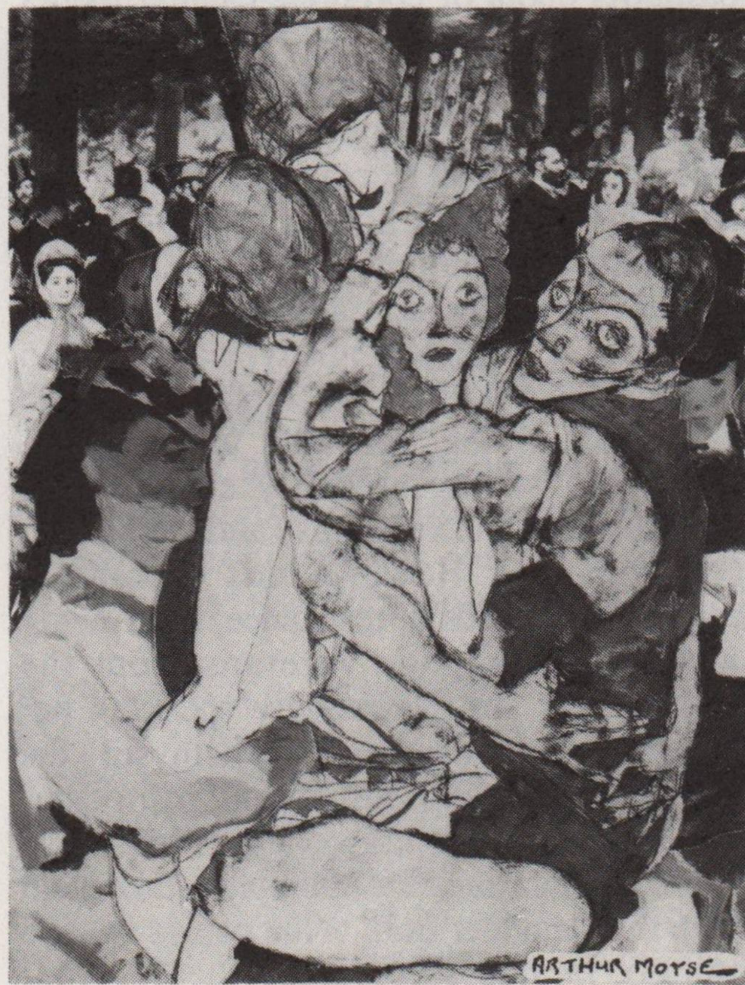
Schiele versus the Impressionists: collage by Arthur Moysé

contains a fantastic bibliography that ranges from a seventeenth century chapbook, an English mummers play of 1899 to the Hoovervilles of the American twentieth century depression when the American people lay down in the dust and starved in a world of plenty. It is the saving grace of the common people that in war, revolution, mass starvation