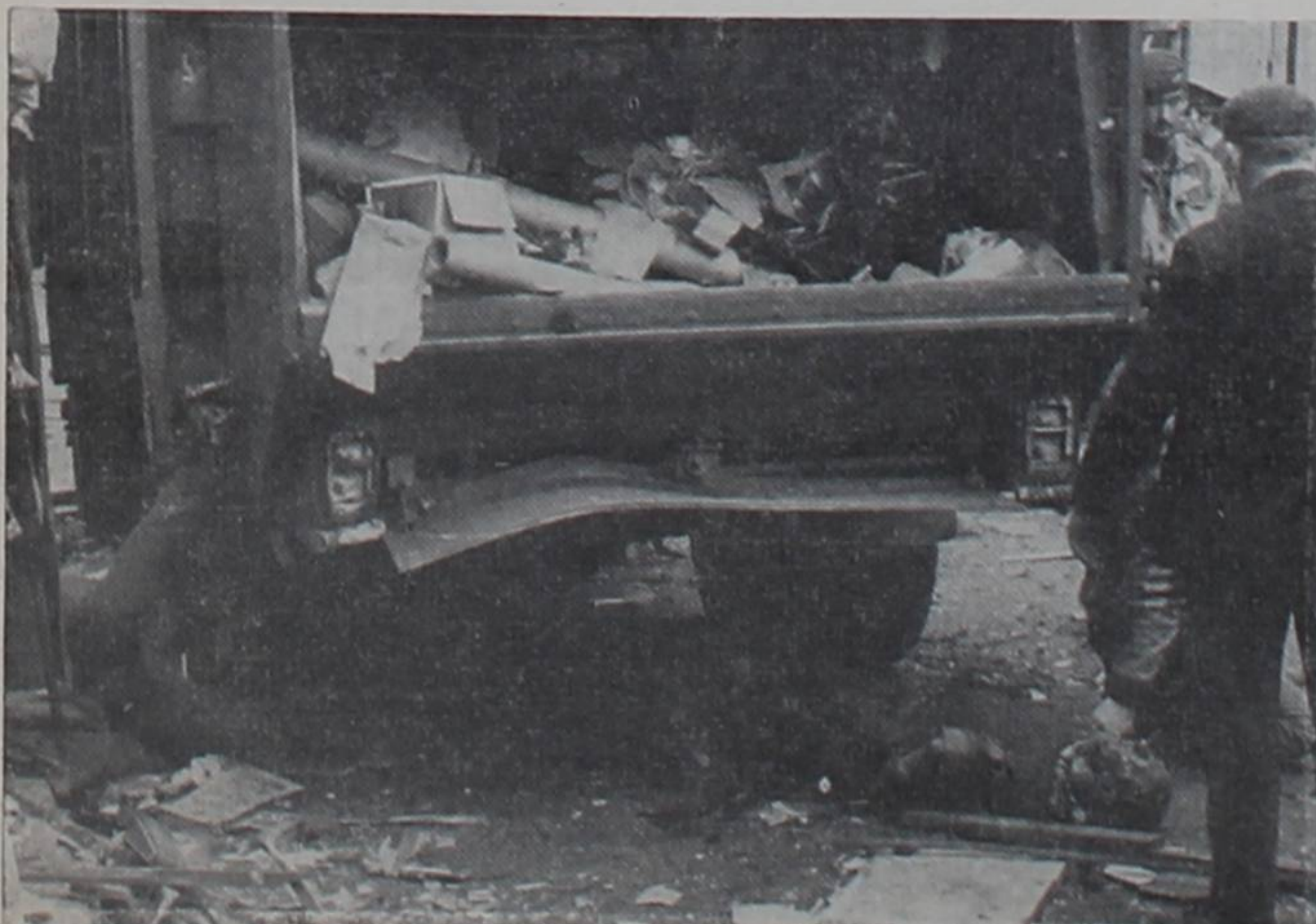
Bomb in Belfast