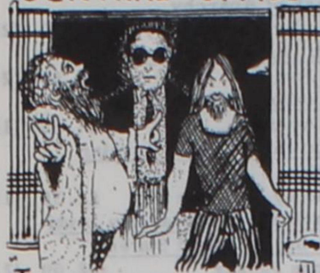
TELL US MAN HOW DO WE JOIN THE PARTY?